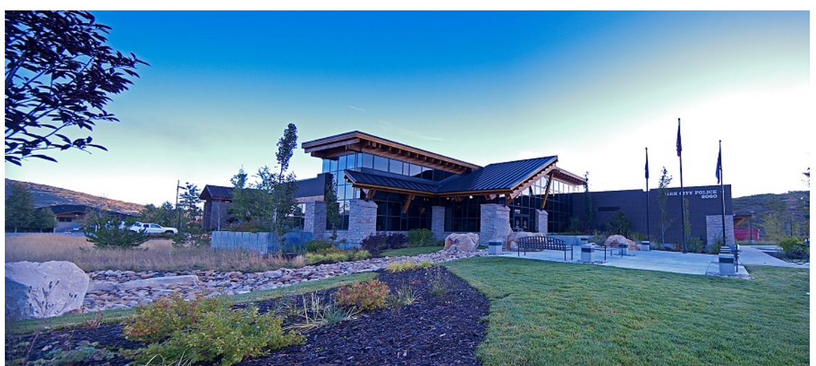
Park City Police Department, 2060 Park Avenue, Park City, UT 84060

The Public Safety Department, which is comprised of the Police Department and the Communications Center, offers a wide variety of services and programs to the community, its citizens and our guests. As outlined in our department mission statement, it is the desire of the Public Safety Department to work closely with the community to create partnerships that will address issues, solve problems and maintain our quality of life.