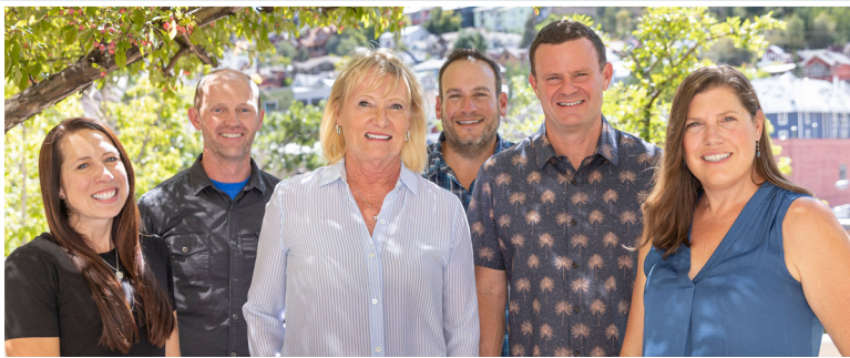
2023 CITY COUNCIL

The six-member Park City Council is the elected body in charge of overseeing the overall policy direction and budget of Park City Municipal. The Council consists of the Mayor and five at-large members elected to four-year terms. Every major highlight in this document is a result of Council leadership and support. The Council meets an average of three times a month, but their schedules are also filled with special meetings, constituent sit-downs, and community events throughout the year. Each Council member also serves as a liaison to several City departments and community groups to provide extra guidance throughout the year.