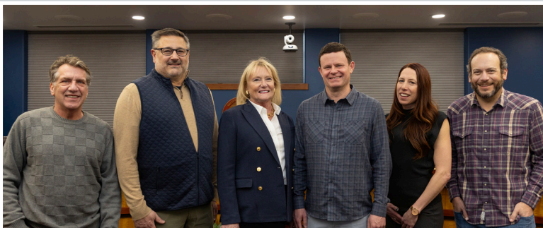
2024 CITY COUNCIL