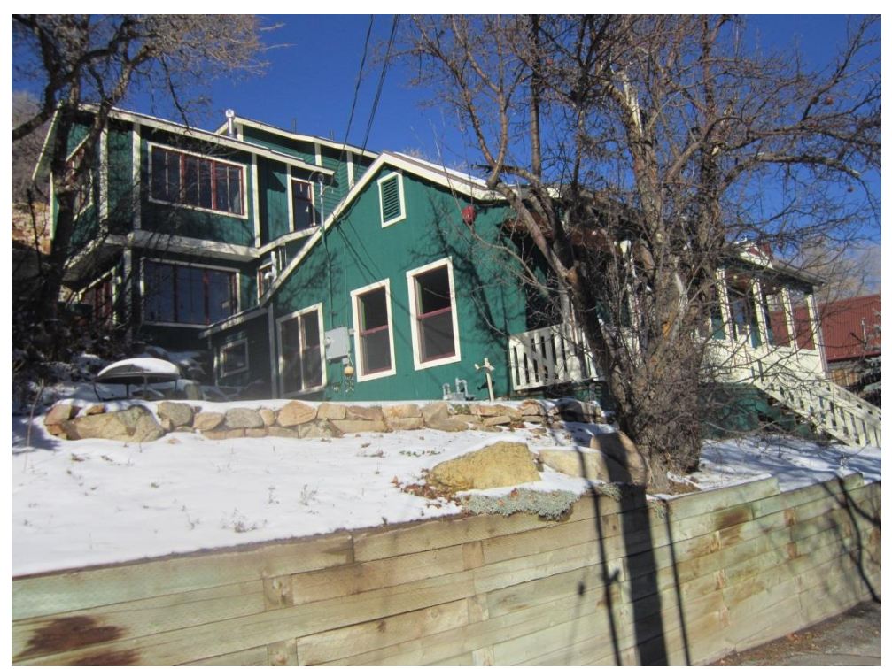
60 Sampson Avenue. Southeast oblique. November 2013.