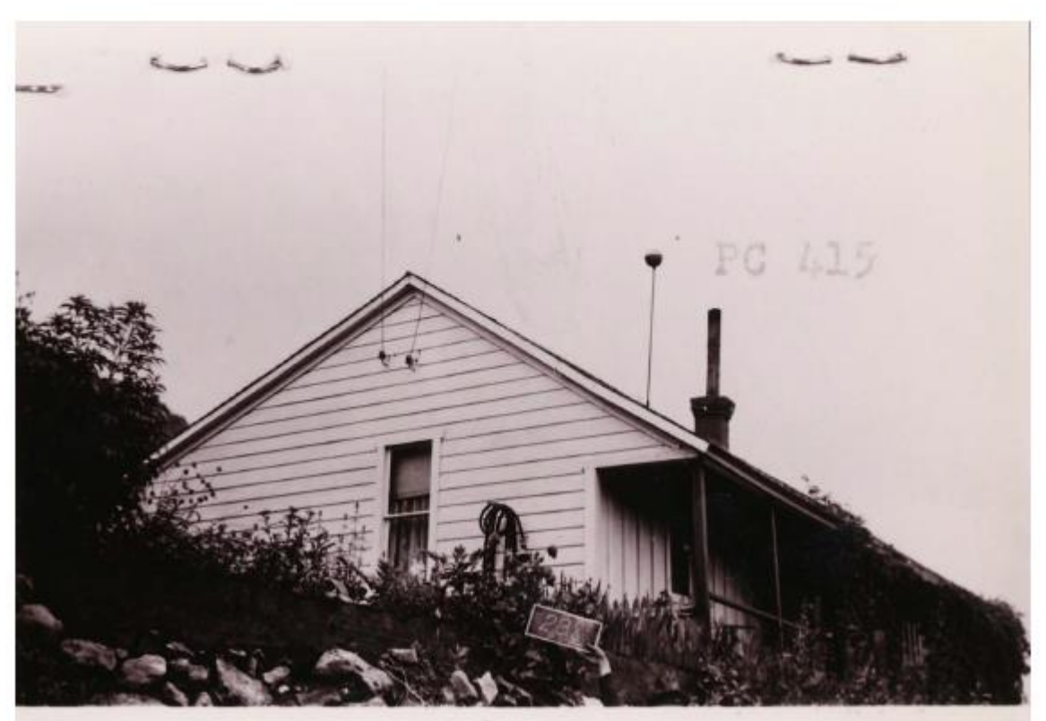
Tax photo c. 1940

60 Sampson Avenue, Park City, Summit County, Utah Intensive Level Survey—Biographical and Historical Research Materials