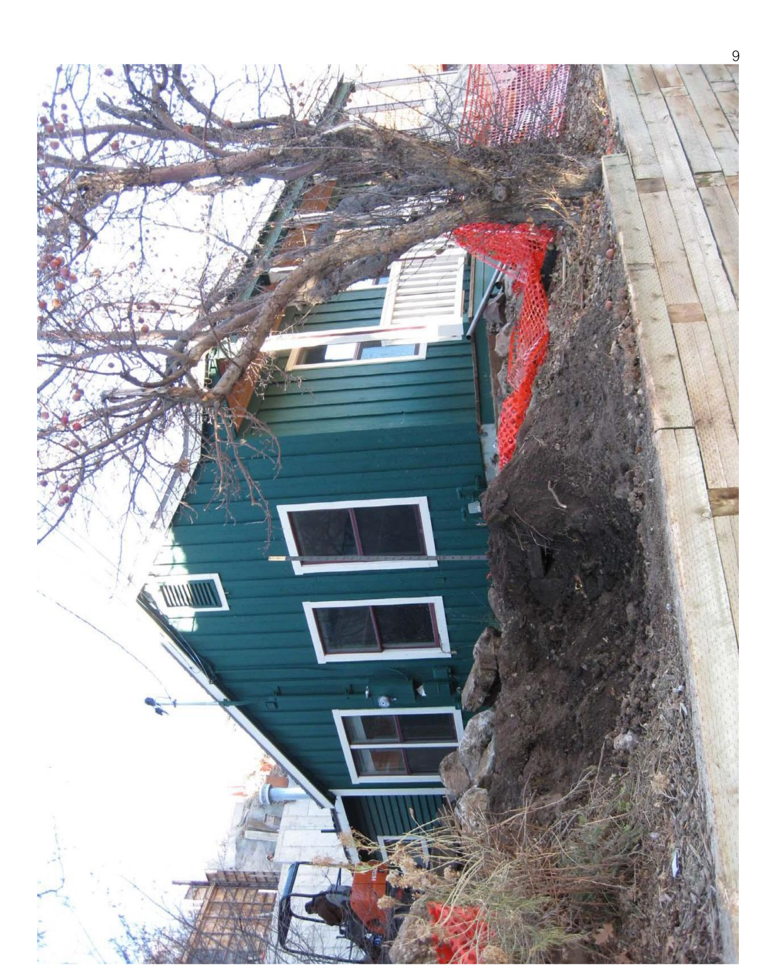
Planning Department/ Park City Corporation