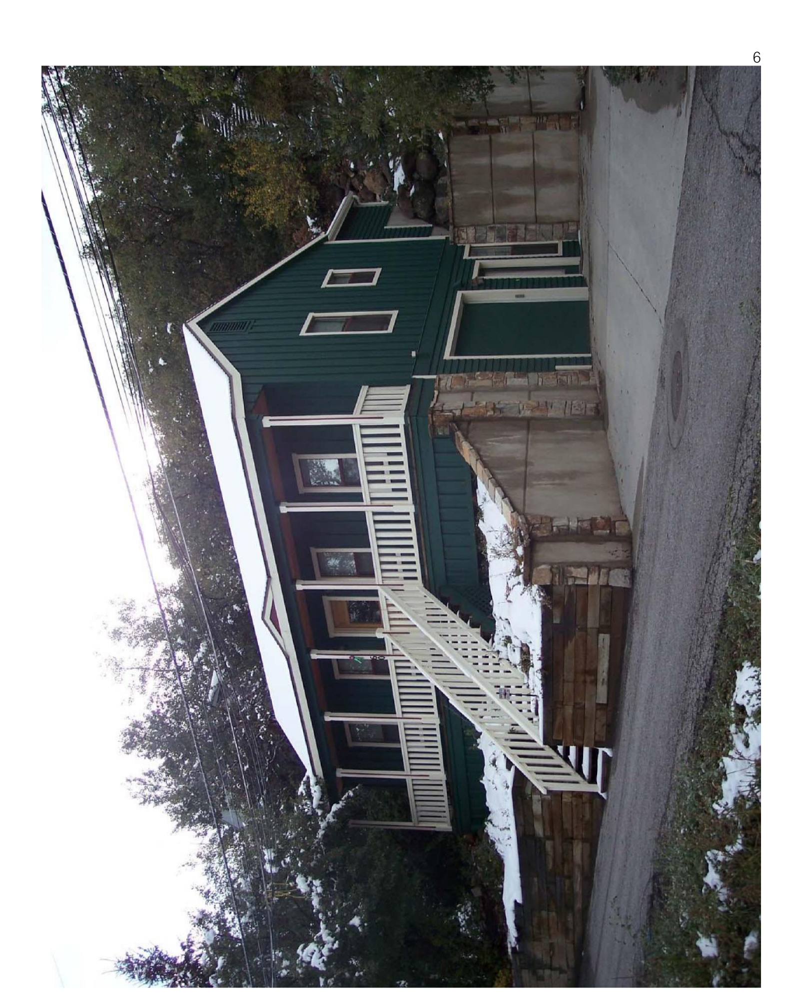
Planning Department/ Park City Corporation