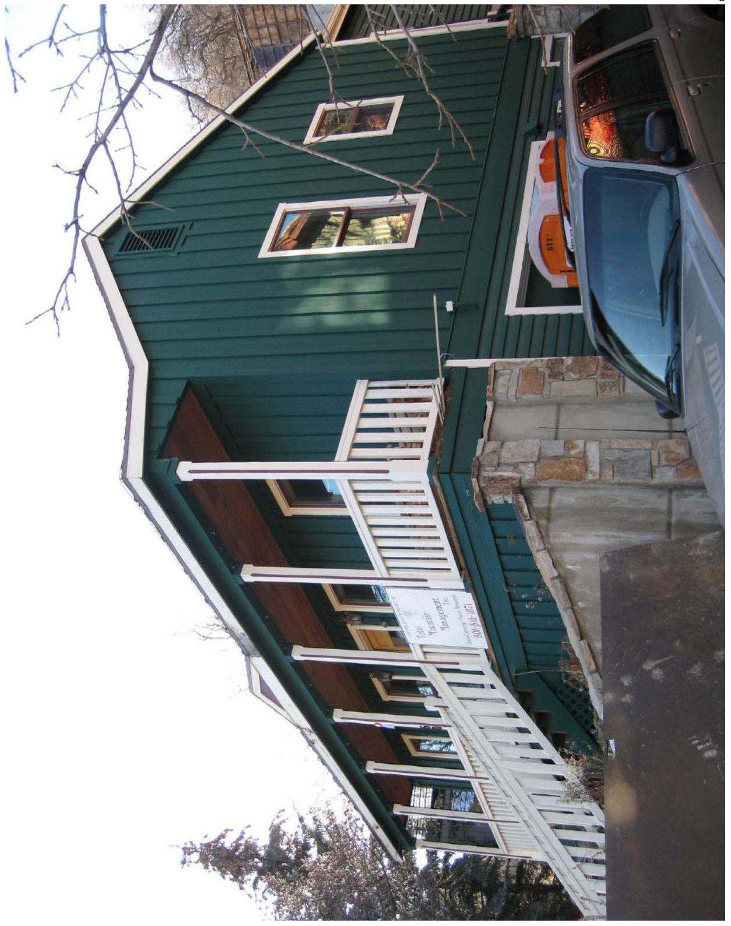
Planning Department/ Park City Corporation