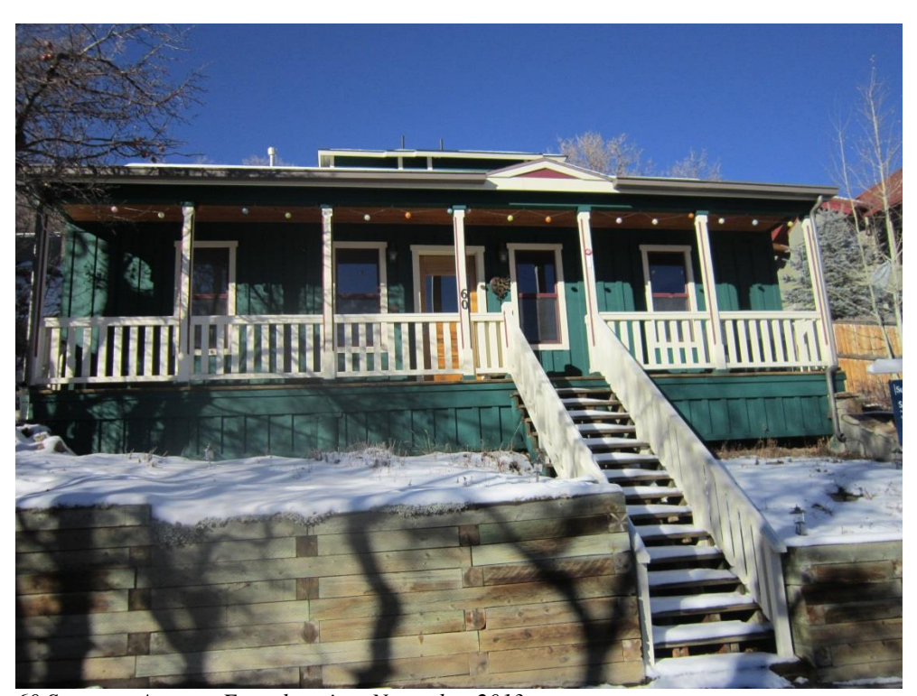
60 Sampson Avenue. East elevation. November 2013.