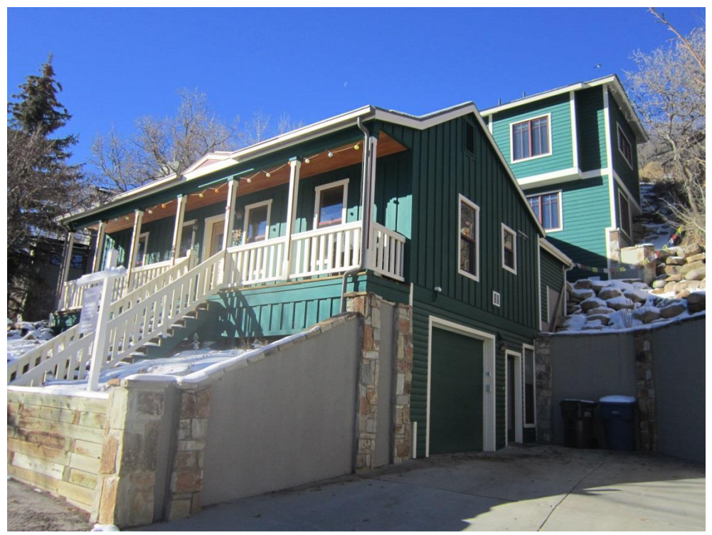
60 Sampson Avenue. Northeast oblique. November 2013.