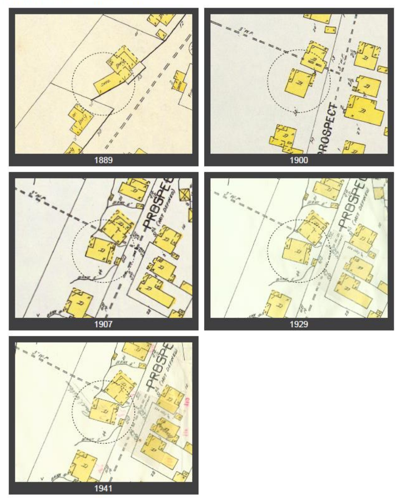
60 Prospect St, Park City, Summit County, Utah Intensive Level Survey—Sanborn Map history