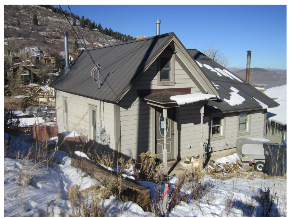
60 Prospect Street. Southeast oblique. November 2013.