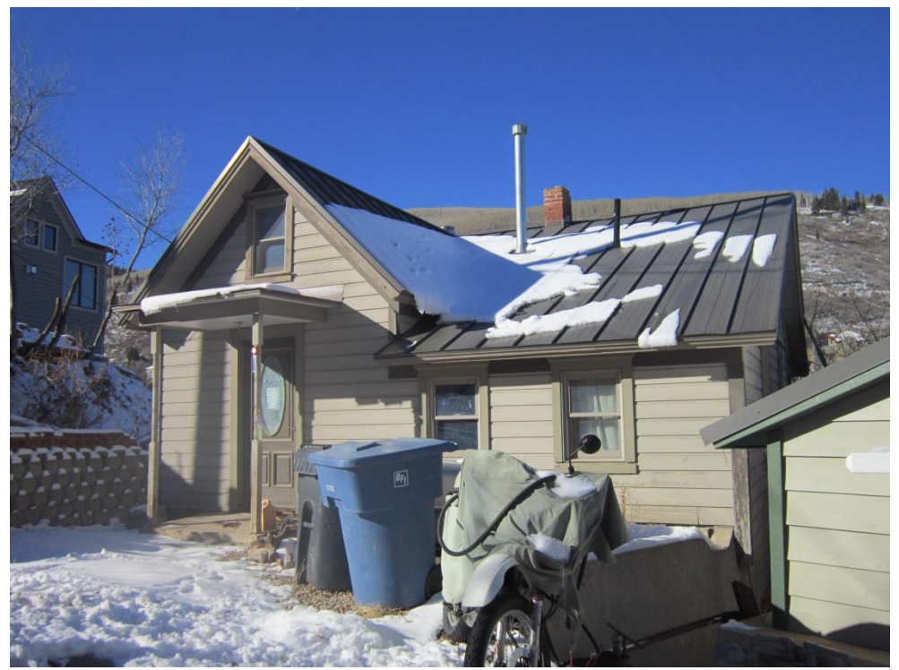
60 Prospect Street. Northeast oblique. November 2013.