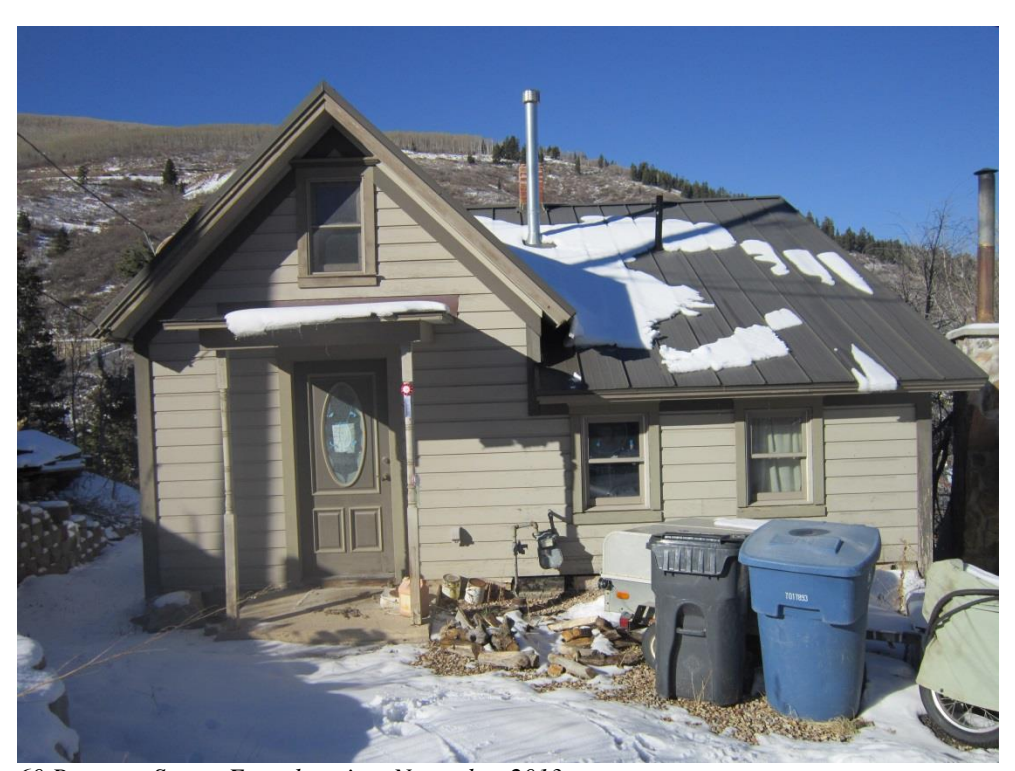
60 Prospect Street. East elevation. November 2013.