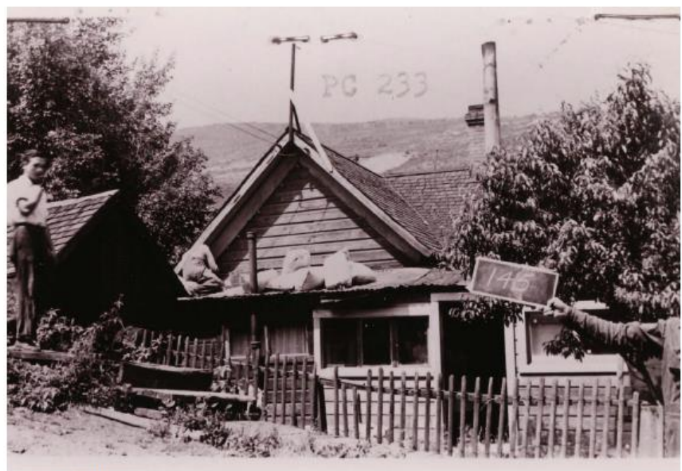
Tax photo c. 1940

Intensive Level Survey-Biographical and Historical Research Materials