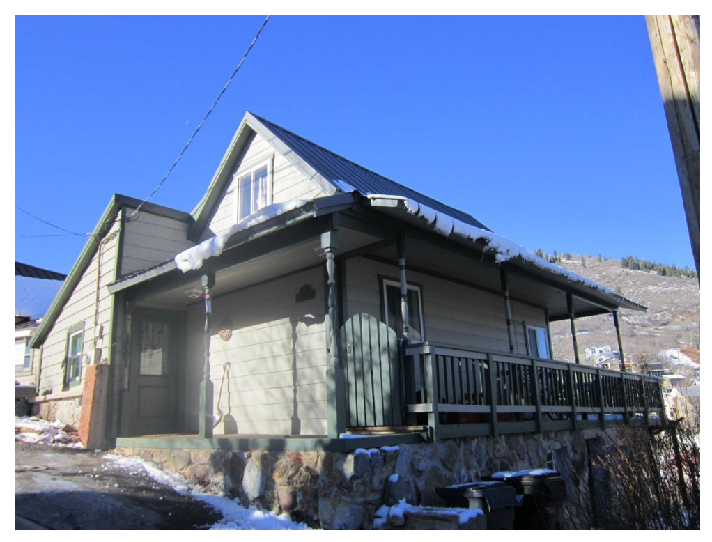
52 Prospect Street. Northwest oblique. November 2013.