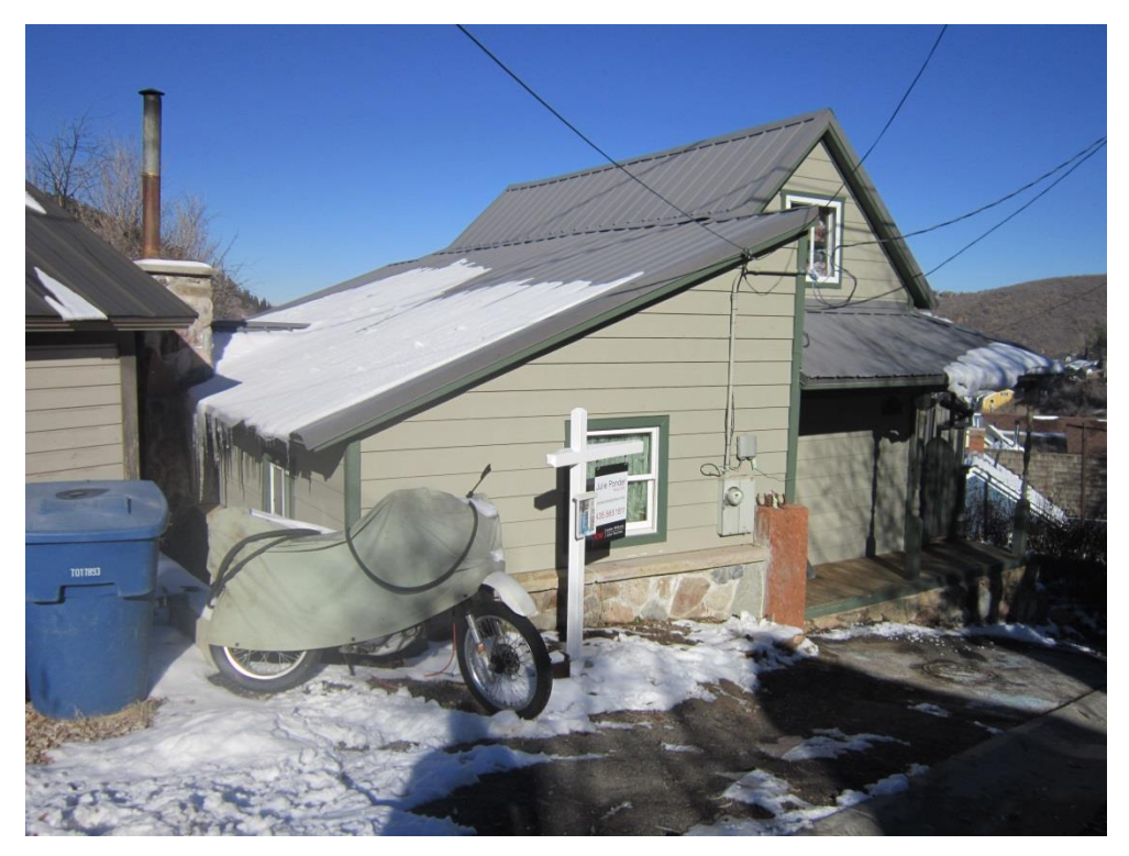
52 Prospect Street. Southwest oblique. November 2013.