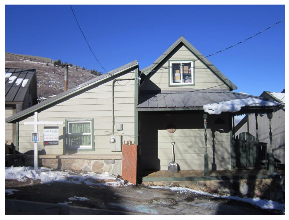
52 Prospect Street. West elevation. November 2013.