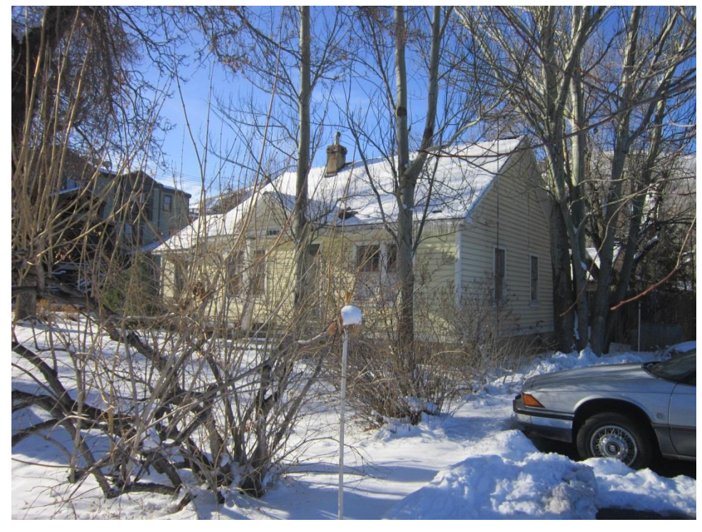
1503 Park Avenue. Northeast oblique. November 2013.