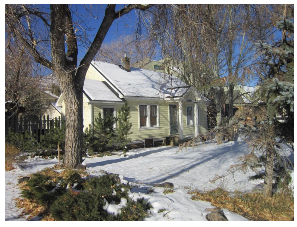
1503 Park Avenue. Southeast oblique. November 2013.