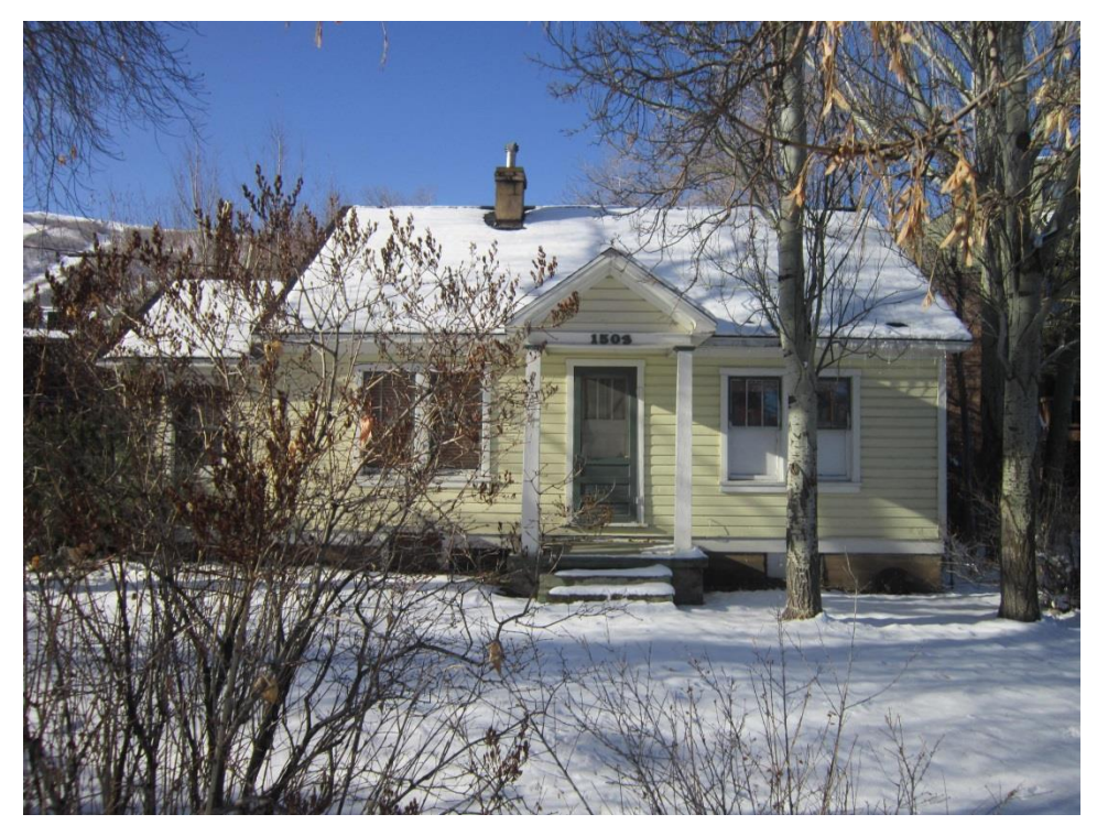
1503 Park Avenue. East elevation. November 2013.