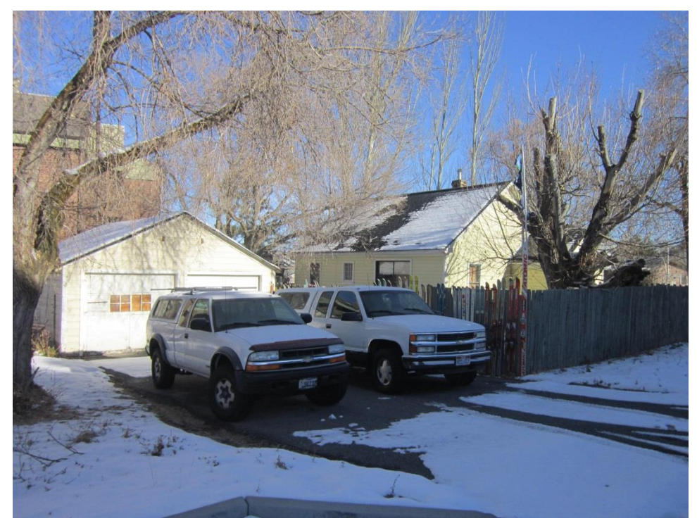
1503 Park Avenue and outbuilding. Southwest oblique. November 2013.