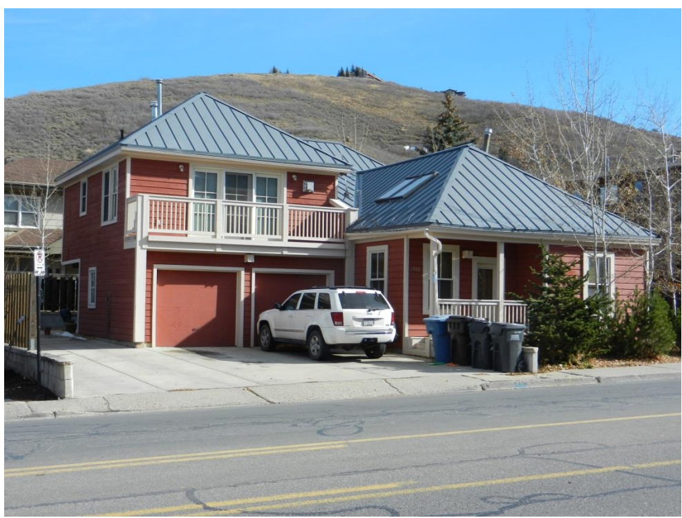
1488 Park Avenue. Northwest oblique. November 2013.