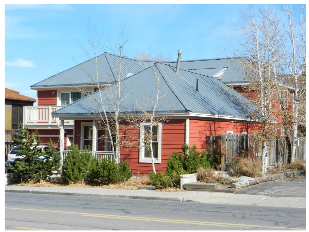
1488 Park Avenue. Southwest oblique. November 2013.