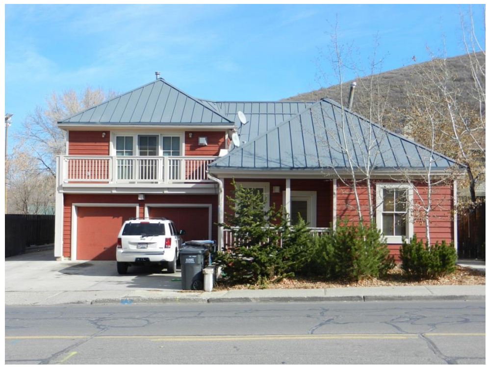
1488 Park Avenue. West elevation. November 2013.