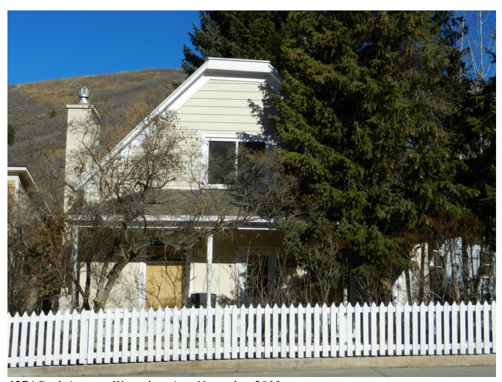
1274 Park Avenue. West elevation. November 2013.