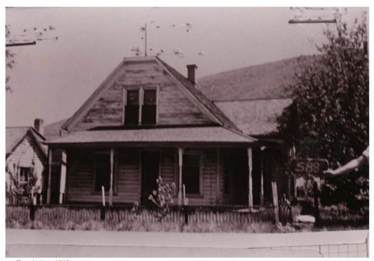
Tax photo c. 1940

1274 Park Avenue, Park City, Summit County, Utah Intensive Level Survey—Biographical and Historical Research Materials