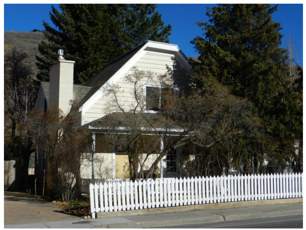
1274 Park Avenue. Northwest oblique. November 2013.