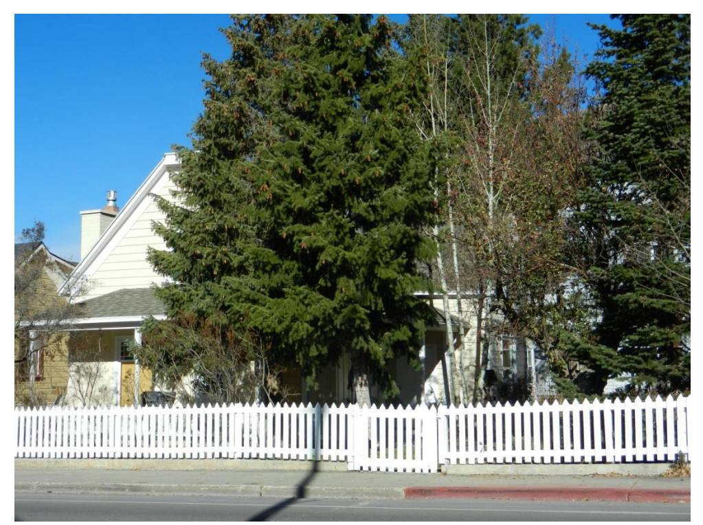
1274 Park Avenue. Southwest oblique. November 2013.