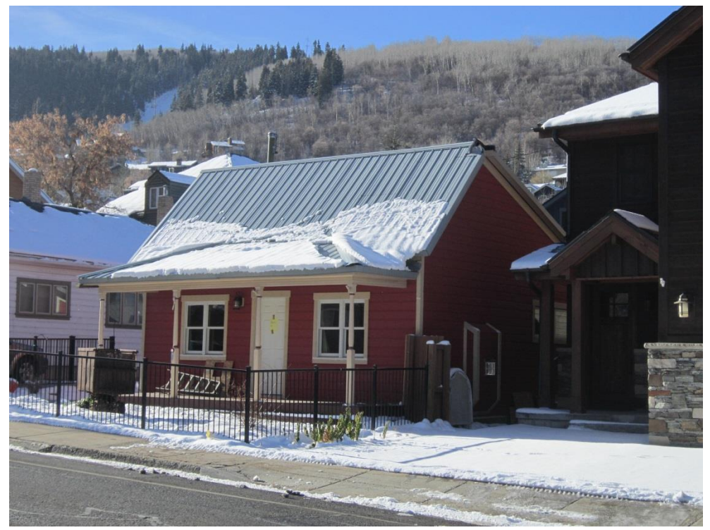
1149 Park Avenue. Northeast oblique. November 2013.