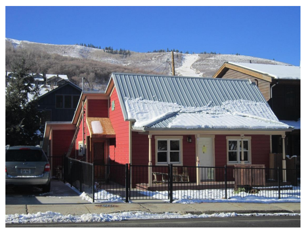
1149 Park Avenue. Southeast oblique. November 2013.