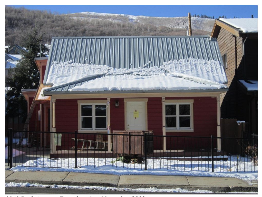
1149 Park Avenue. East elevation. November 2013.