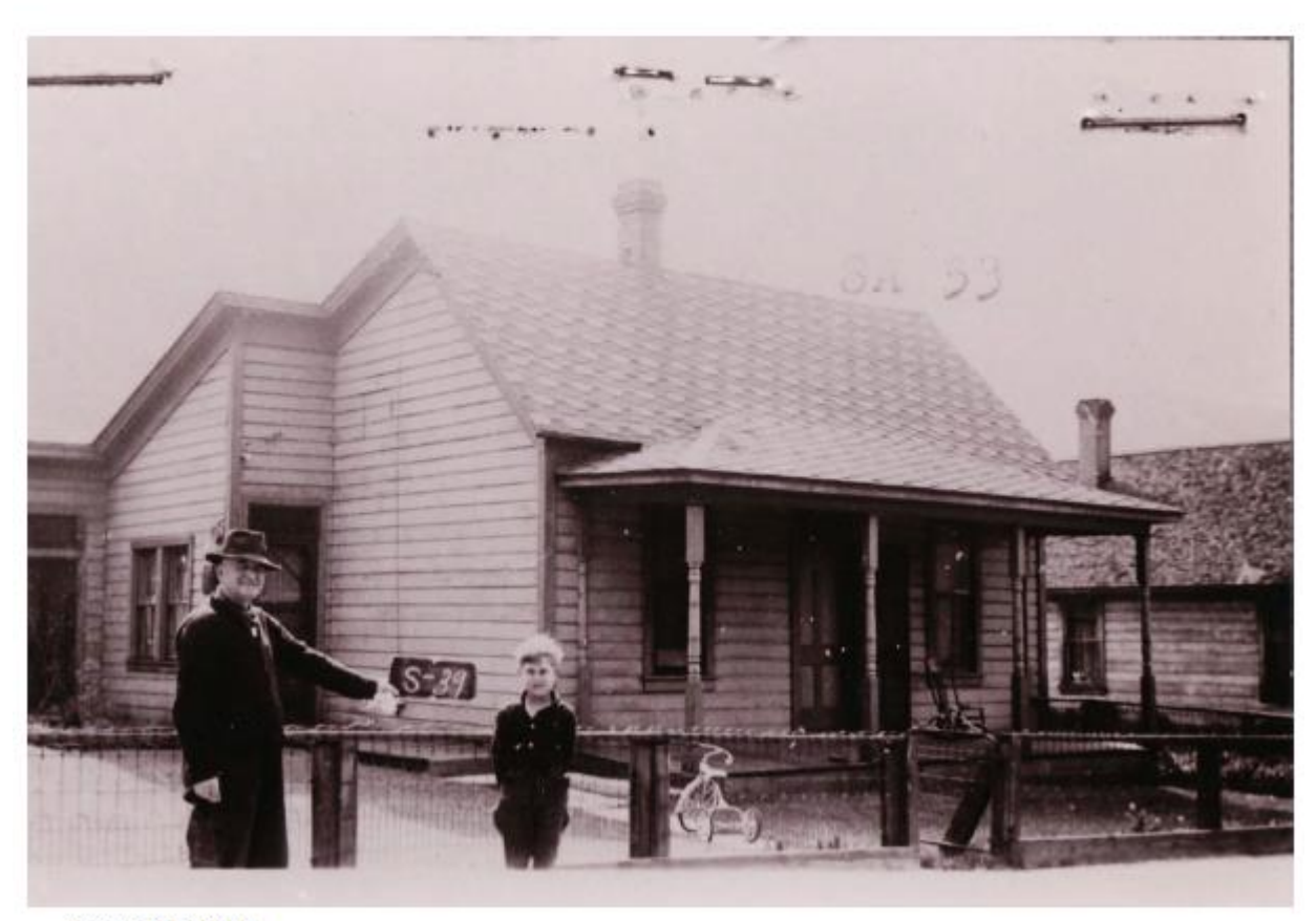
Tax photo c. 1940

1149 Park Avenue, Park City, Summit County, Utah Intensive Level Survey—Biographical and Historical Research Materials