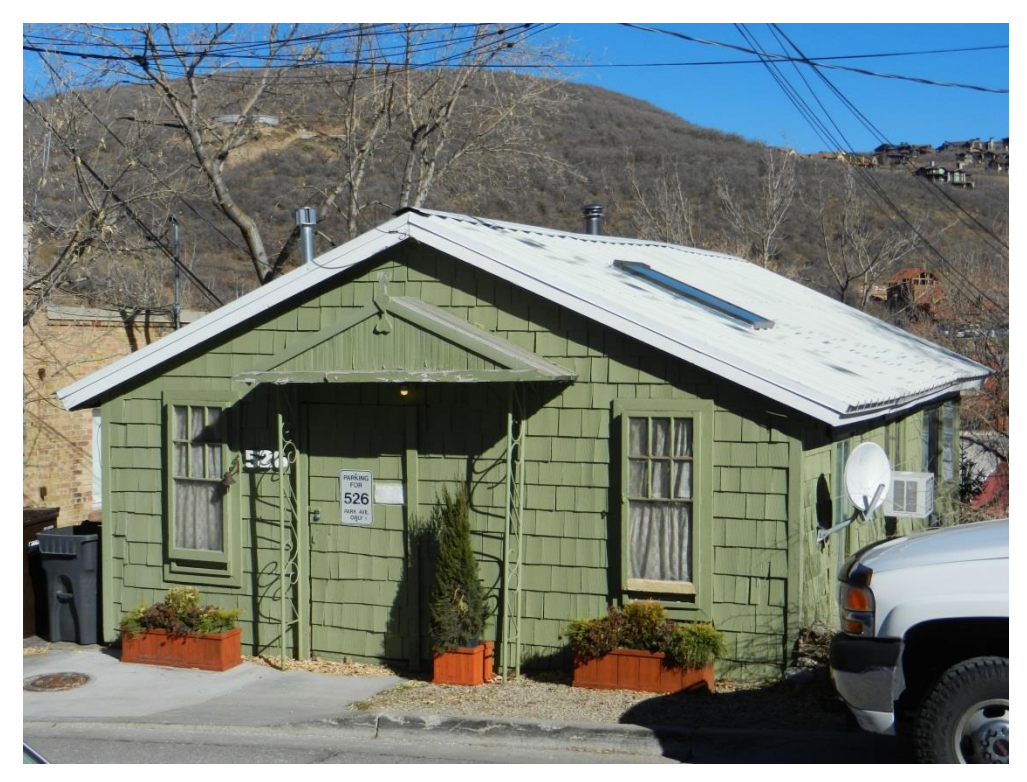
526 Park Avenue. Southwest oblique. November 2013.