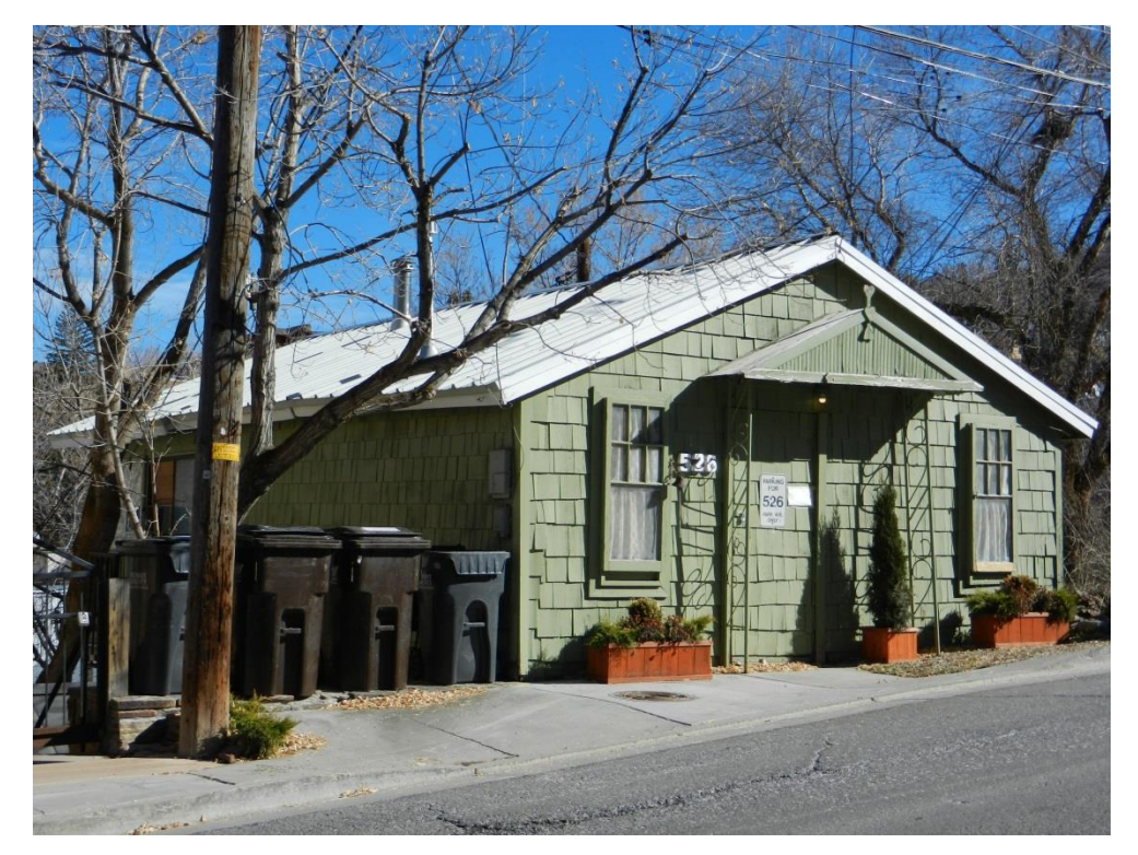
526 Park Avenue. Northwest oblique. November 2013.