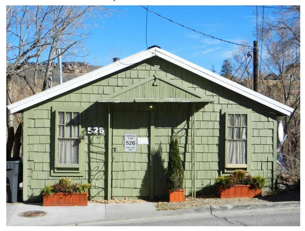
526 Park Avenue. West elevation. November 2013.