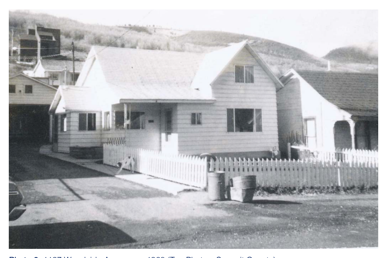
Photo 8: 1127 Woodside Avenue. c. 1968