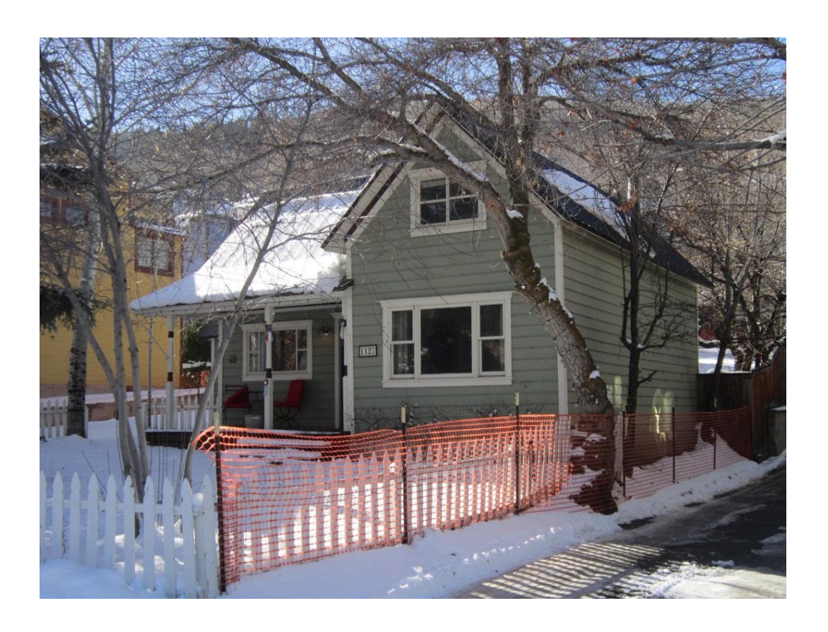
Planning Department/ Park City Corporation