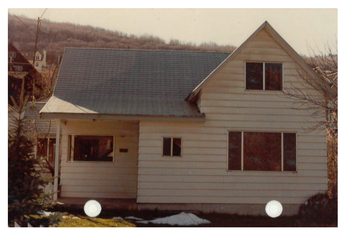
Photo 7: 1127 Woodside Avenue in 1981 (Historic Architectural Survey, 1982)