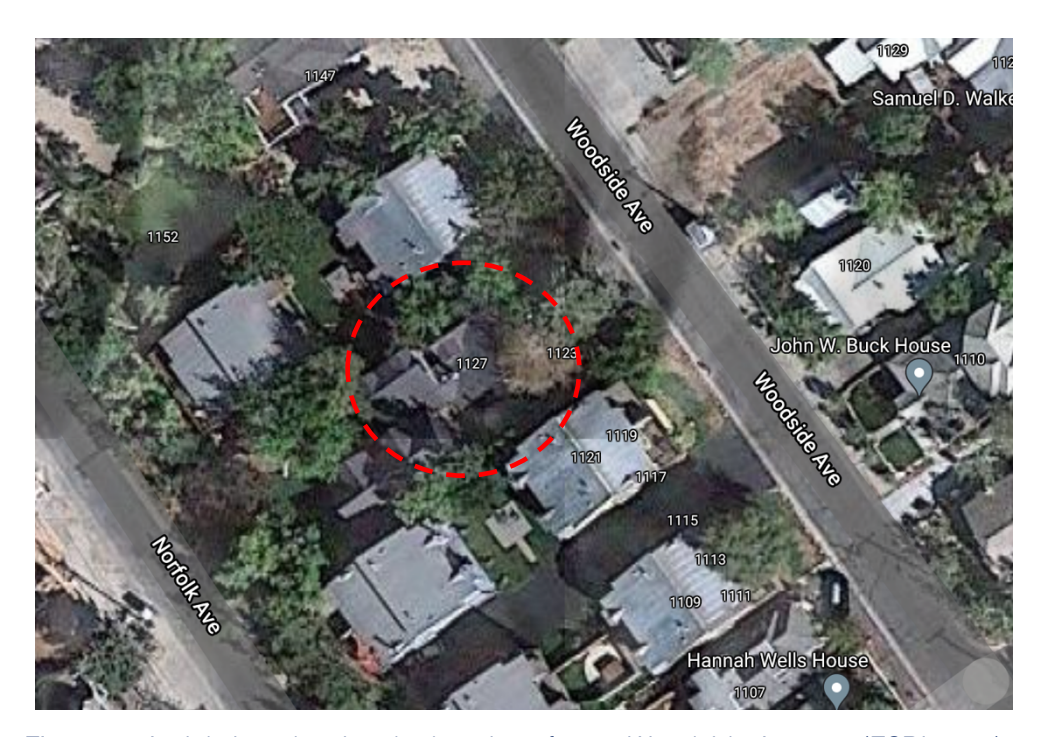
Figure 1: Aerial view showing the location of 1127 Woodside Avenue. (ESRI 2020)

(Provide several clear historical and current maps indicating the location of the property in relation to streets or other widely recognized features.)