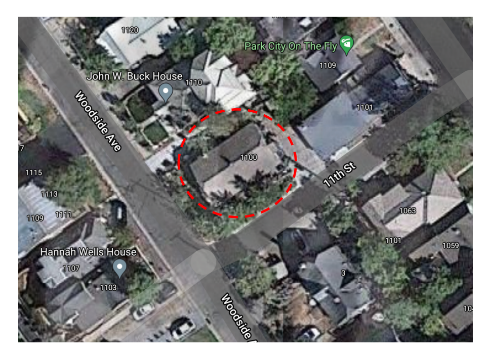
Figure 1: Aerial view showing the location of 1100 Woodside Avenue. (ESRI 2020)

(Provide several clear historical and current maps indicating the location of the property in relation to streets or other widely recognized features.)