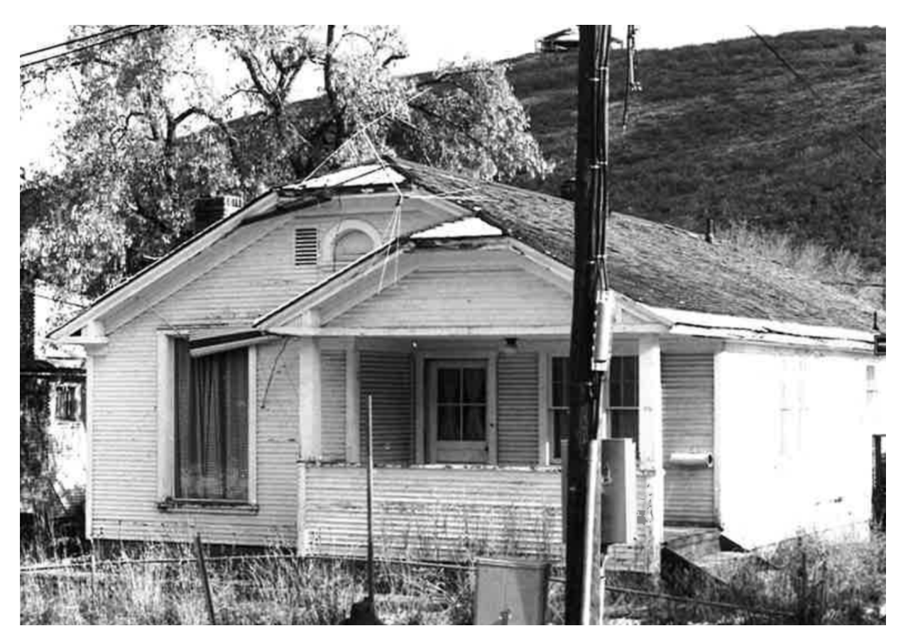
Photo 7: 1100 Woodside Avenue in 1983