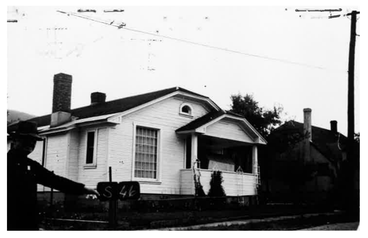
Photo 8: 1100 Woodside Avenue. c. 1941