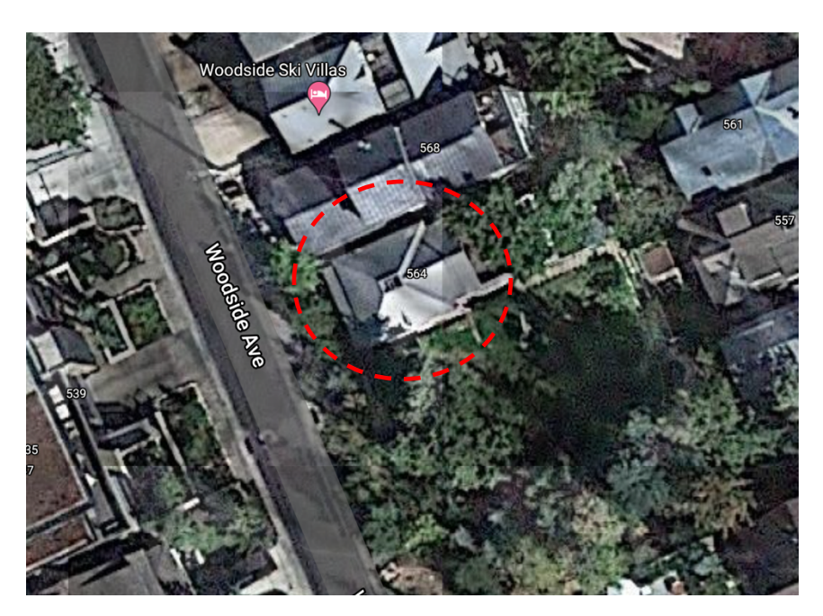
Figure 1: Aerial view showing the location of 564 Woodside Avenue. (ESRI 2020)

(Provide several clear historical and current maps indicating the location of the property in relation to streets or other widely recognized features.)