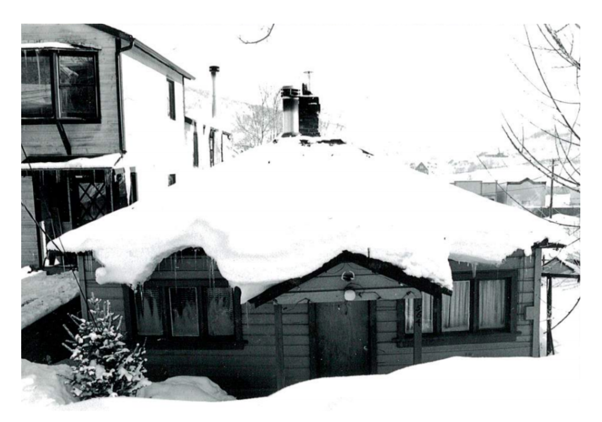
Photo 7: 564 Woodside Avenue in 1982 (Historic Architectural Survey, 1982)