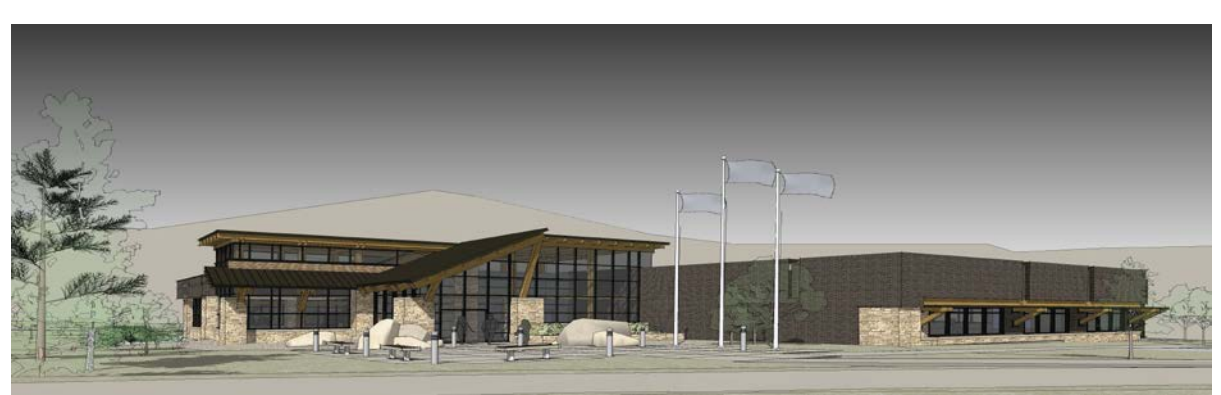
Conceptual Drawing of Police Facility