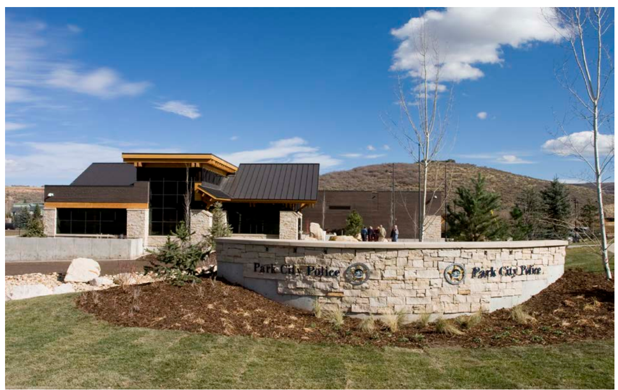
New Police Facility located at 2060 Park Avenue

The Public Safety Department, which is comprised of the Police Department and the Communications Center, offers a wide variety of services and programs to the community, its citizens and our guests. As outlined in our department mission statement, it is the desire of the Public Safety Department to work closely with the community to create partnerships that will address issues, solve problems and maintain our quality of life.