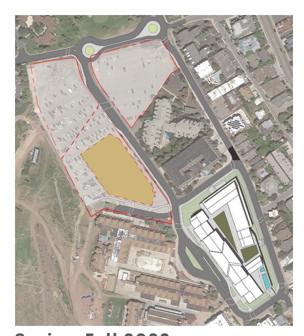
Spring-Fall 2022 Parcel B completes Parcel C garage excavation and construction