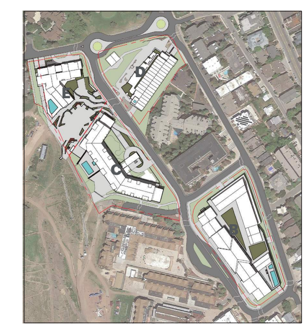
Complete January 2026