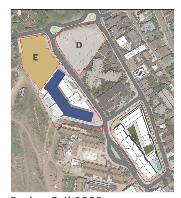
Spring-Fall 2023 Parcel C above garage construction Parcel E garage excavation and construction