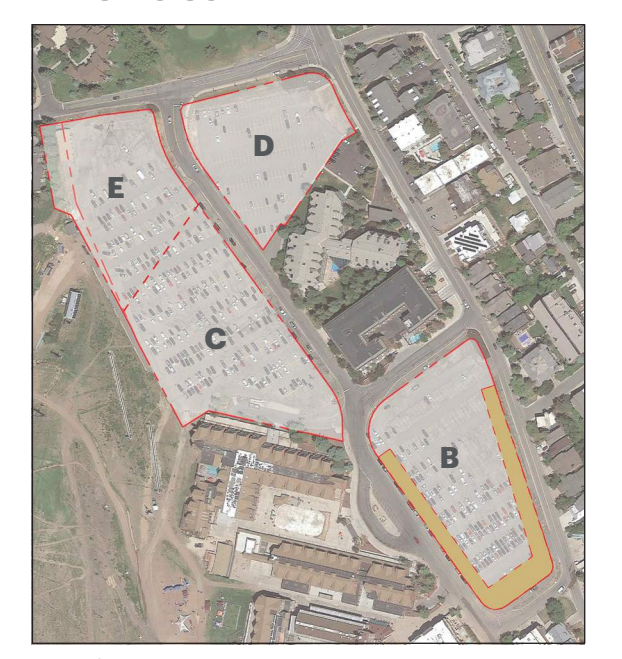
Spring 2021 Parcel B shoring