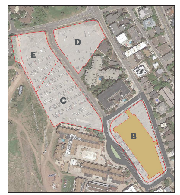
Spring-Fall 2021 Parcel B garage excavation and construction