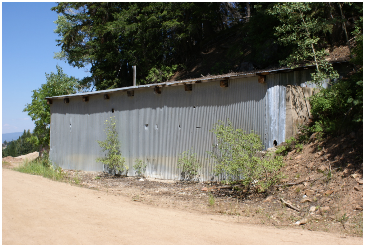
Judge Mine Shed Structure, 2009