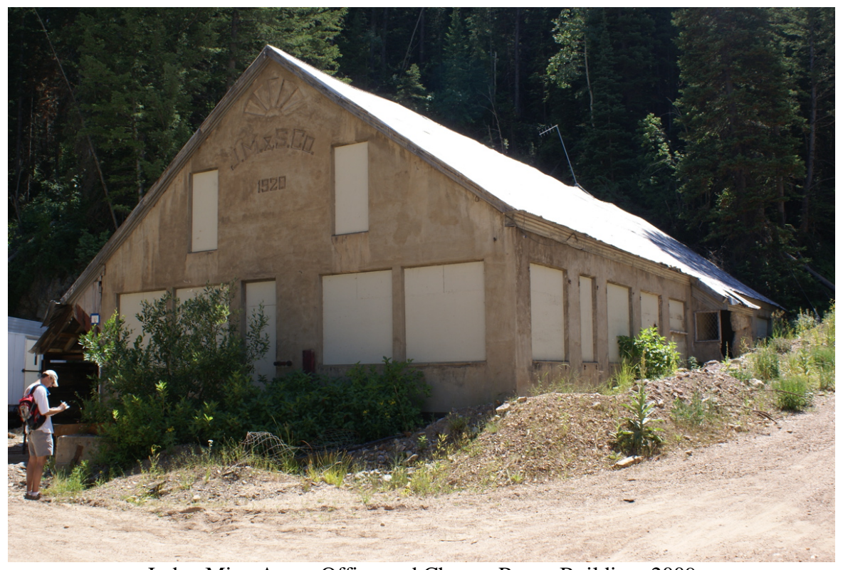
Judge Mine Assay Office and Change Room Building, 2009