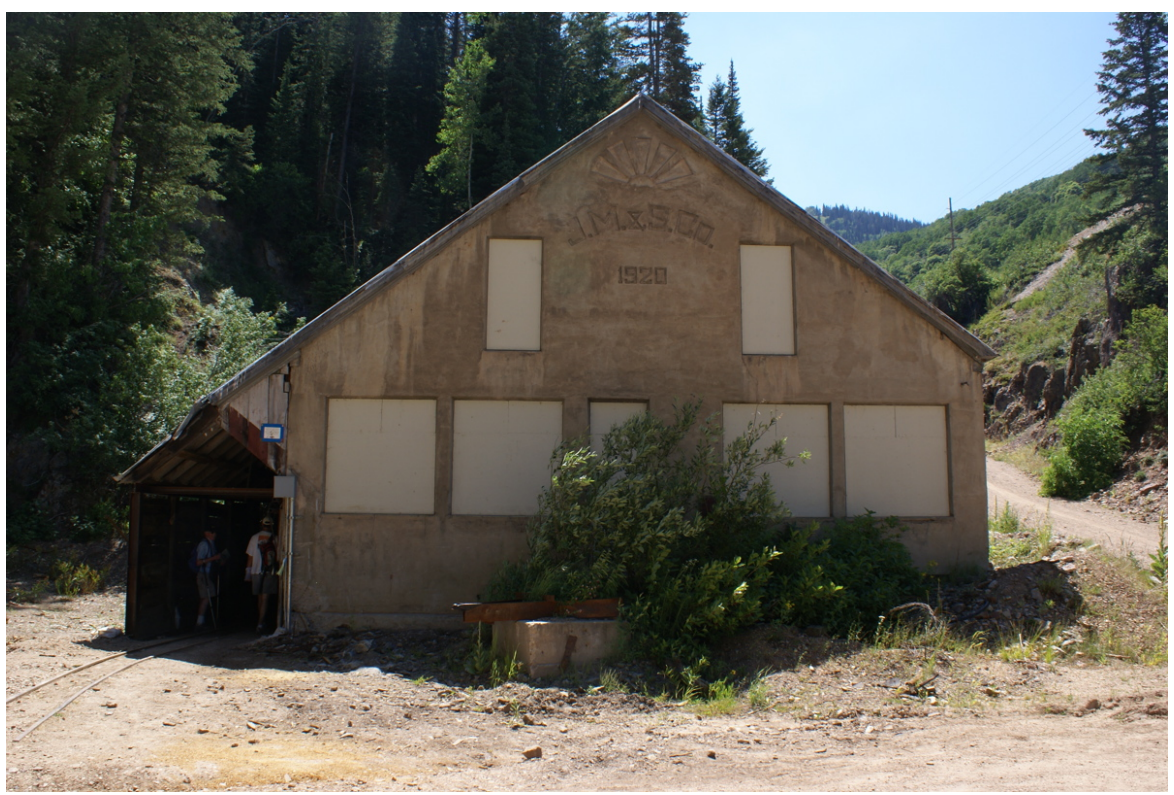
Judge Mine Assay Office and Change Room Building, 2009