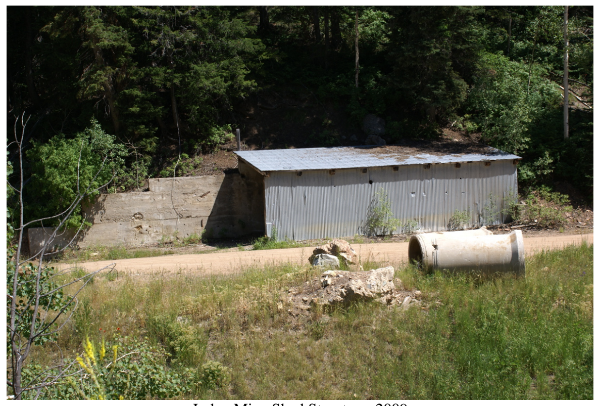
Judge Mine Shed Structure, 2009