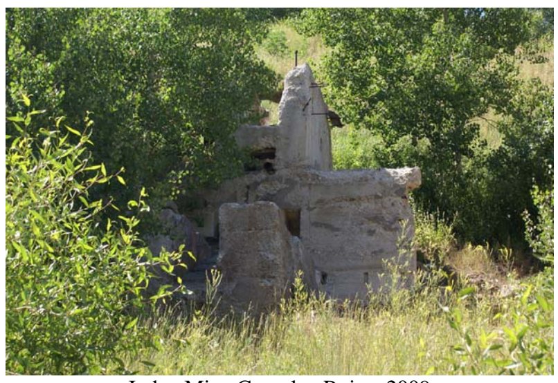
Judge Mine Complex Ruins, 2009