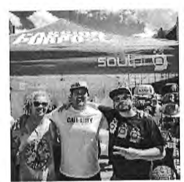
Soulpro Call of Duty Founder.JPG 345K