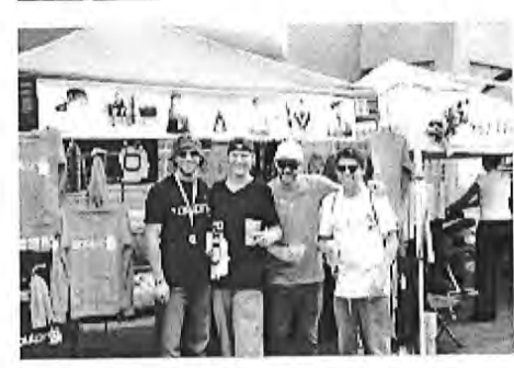
OG Crew.jpg 115K