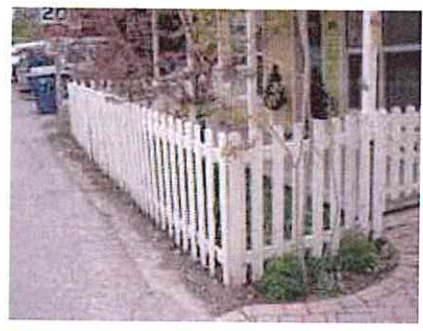
Stone retaining walls and fences like these contribute to the character of the districts and help to define the street edge.