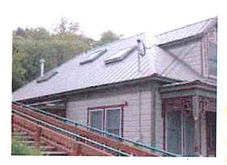
These skylights are flush mounted and unobtrusive when viewed from the public right-of-way.