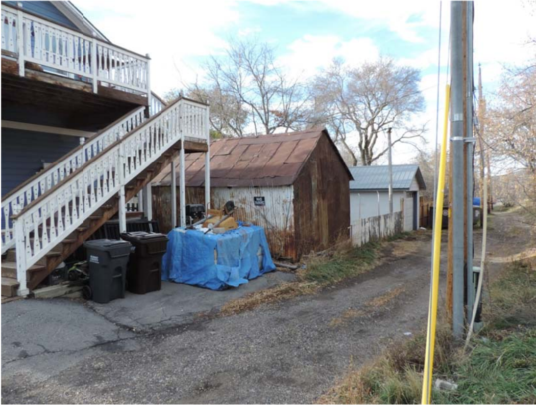
Photo No. 2: Southeast oblique. Camera facing northwest. November 2014.