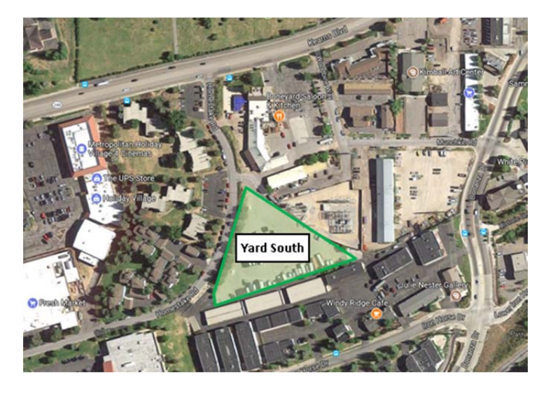
Figure 1 Affordable Housing Areas / Phases

Additionally, the City has plans to extend Munchkin Road from its' existing terminus at Woodbine Way west through the City owned parcel which is currently occupied the Recycle Utah recycle center. The engineering services to design and engineer the Munchkin Road extension will be procured through a separate RFP process; however, firms submitting proposals for the Scope of Work outlined below should consider vehicular, pedestrian, and bicycle access from existing Homestake Drive as well as the future Munchkin Road extension as part of this RFP.