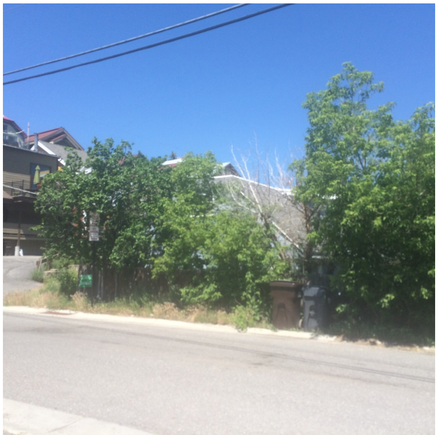
1302 Norfolk Avenue. South Elevation. June 2016.