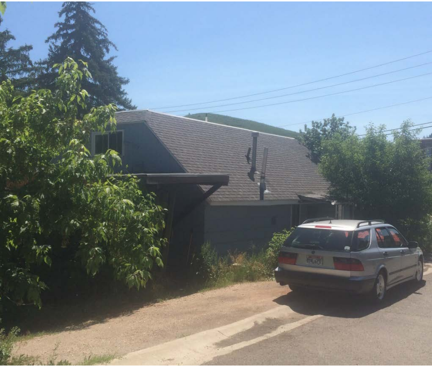
1302 Norfolk Avenue. Northwest oblique. June 2016.