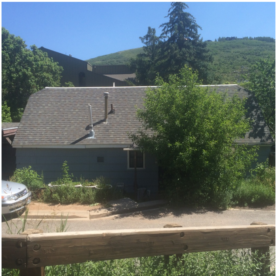
1302 Norfolk Avenue. West Elevation. June 2016.