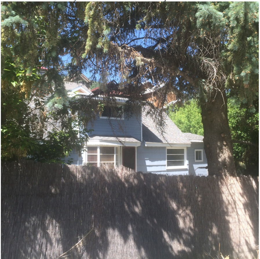
1302 Norfolk Avenue. East Elevation. June 2016.