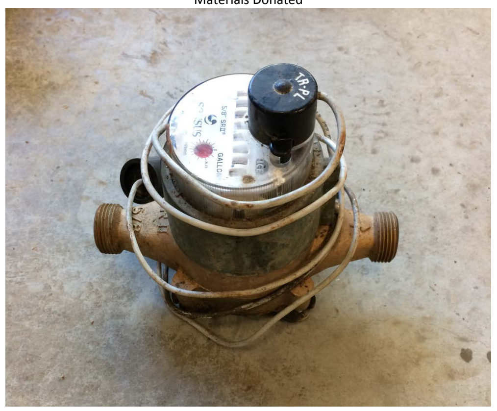
EXHIBIT "B" (AMENDED) Materials Donated