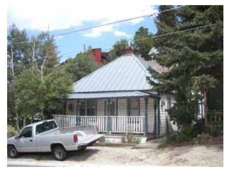
416 MARSAC AVENUE Landmark Site Designated Feb. 4, 2009