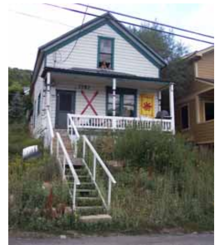
1101 NORFOLK AVENUE Landmark Site Designated Feb. 4, 2009