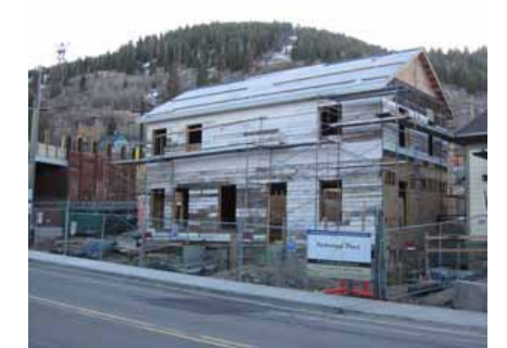
801 PARK AVENUE (Pre-rehabilitation) Significant Site Designated Feb. 4, 2009