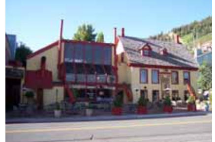
628 PARK AVENUE Significant Site Designated Feb. 4, 2009