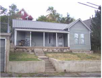
1135 NORFOLK AVENUE Significant Site Designated Feb. 4, 2009