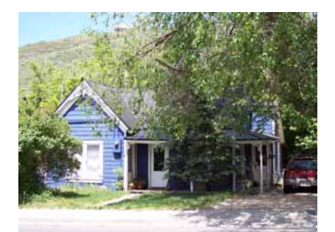
1124 PARK AVENUE Landmark Site Designated Feb. 4, 2009