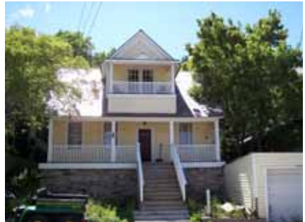
445 PARK AVENUE Landmark Site Designated Feb. 4, 2009