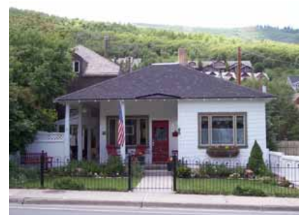
1141 PARK AVENUE Landmark Site Designated Feb. 4, 2009