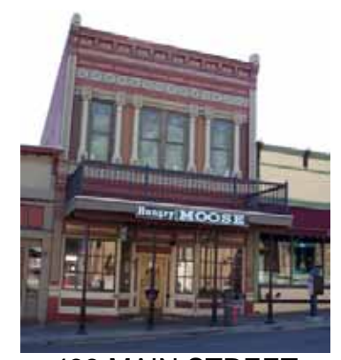
438 MAIN STREET Landmark Site Designated Feb. 4, 2009