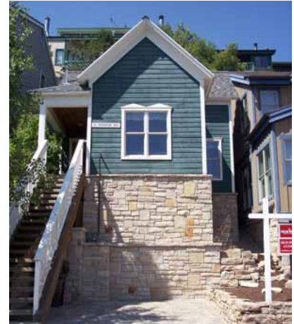
311 WOODSIDE AVENUE Significant Site Designated Feb. 4, 2009