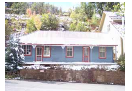
118 DALY AVENUE (pre-partial Reconstruction) Significant Site Designated Feb. 4, 2009