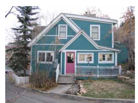
830 EMPIRE AVENUE Landmark Site Designated Feb. 4, 2009

Sites listed alphabetically by street name then numerically by building number. Only Main Building shown - see individual Historic Site Form for Accessory Buildings and/or Structures on the site. Date HPB designated site to the HSI.