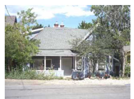
824 NORFOLK AVENUE Landmark Site Designated Feb. 4, 2009