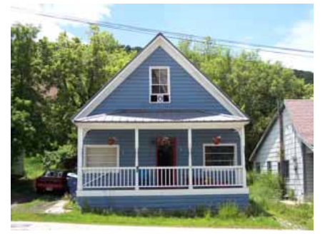
923 PARK AVENUE Significant Site Designated Feb. 4, 2009