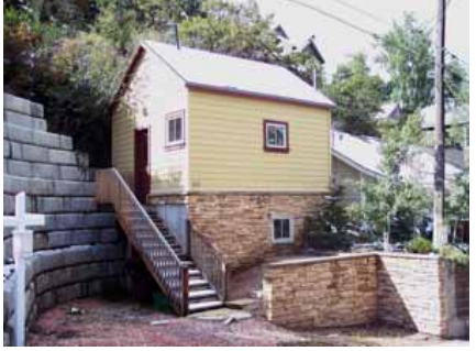
80 KING ROAD Significant Site Designated Feb. 4, 2009