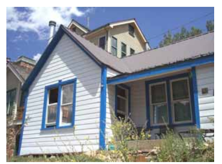
323 ONTARIO AVENUE N Landmark Site Designated Feb. 4, 2009