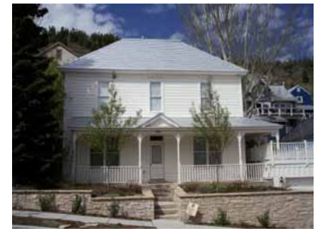
351 PARK AVENUE Landmark Site Designated Feb. 4, 2009