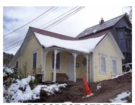
51 PROSPECT STREET Landmark Site Designated Feb. 4, 2009