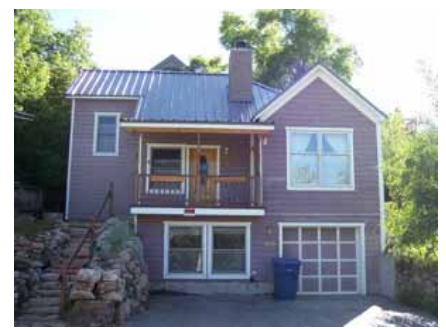
835 WOODSIDE AVENUE Significant Site Designated Feb. 4, 2009