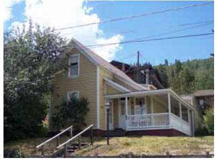
835 EMPIRE AVENUE Landmark Site Designated Feb. 4, 2009