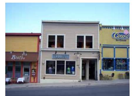
408 MAIN STREET Significant Site Designated Feb. 4, 2009