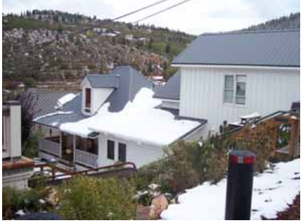
164 NORFOLK AVENUE Significant Site Designated Feb. 4, 2009