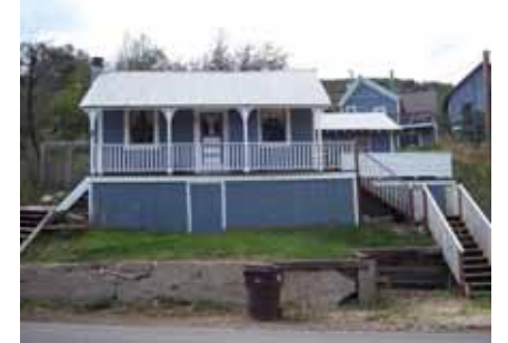
64 CHAMBERS AVENUE Landmark Site Designated Feb. 4, 2009