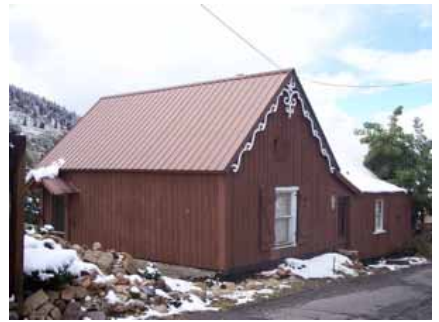
164 SANDRIDGE AVENUE Significant Site Designated Feb. 4, 2009