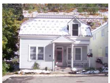
145 DALY AVENUE Landmark Site Designated Feb. 4, 2009