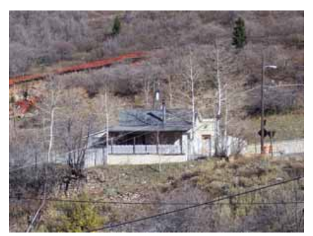
114 HILLSIDE AVENUE Significant Site Designated Feb. 4, 2009