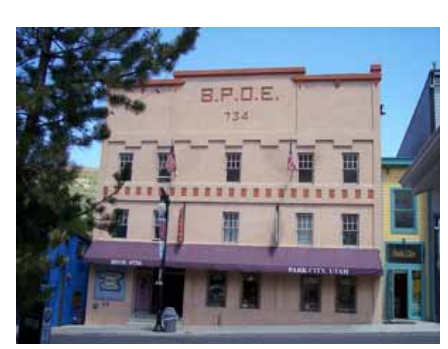
550 MAIN STREET Landmark Site Designated Feb. 4, 2009