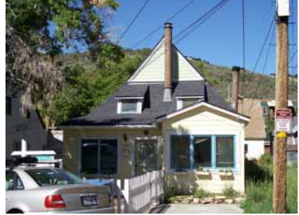
1062 WOODSIDE AVENUE Significant Site Designated Feb. 4, 2009