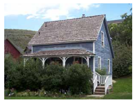
508 MARSAC AVENUE Significant Site Designated Feb. 4, 2009