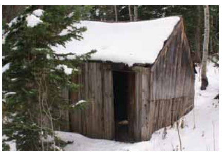
CALIFORNIA-COMSTOCK CABIN Significant Site Designated Feb. 4, 2009