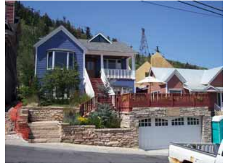
627 WOODSIDE AVENUE Significant Site Designated Feb. 4, 2009