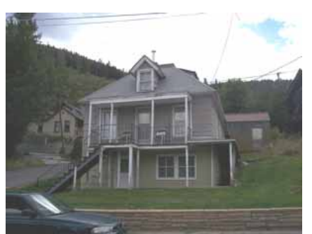
803 NORFOLK AVENUE Significant Site Designated Feb. 4, 2009