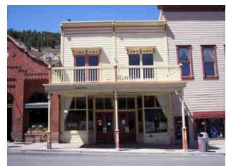
449 MAIN STREET Significant Site Designated Feb. 4, 2009