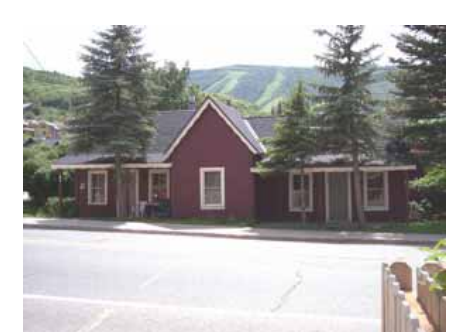
1301 PARK AVENUE Landmark Site Designated Feb. 4, 2009