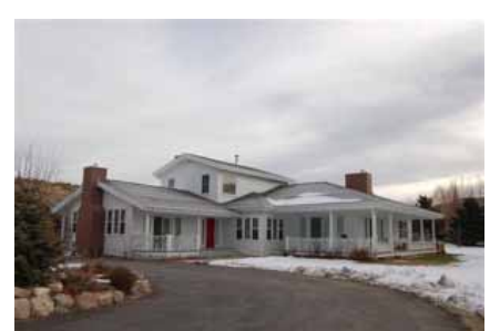
2414 MONITOR DRIVE Significant Site Designated Feb. 4, 2009