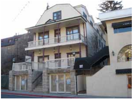
221 MAIN STREET Landmark Site Designated Feb. 4, 2009