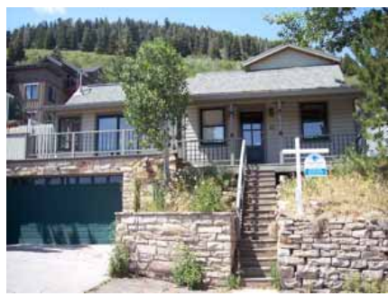
605 WOODSIDE AVENUE Significant Site Designated Feb. 4, 2009