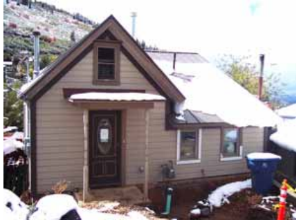
60 PROSPECT STREET Significant Site Designated Feb. 4, 2009