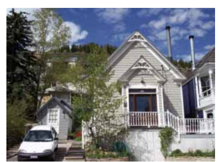
323 PARK AVENUE Landmark Site Designated Feb. 4, 2009