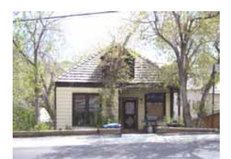
502 PARK AVENUE Landmark Site Designated Feb. 4, 2009

Sites listed alphabetically by street name then numerically by building number. Only Main Building shown - see individual Historic Site Form for Accessory Buildings and/or Structures on the site. Date HPB designated site to the HSI.