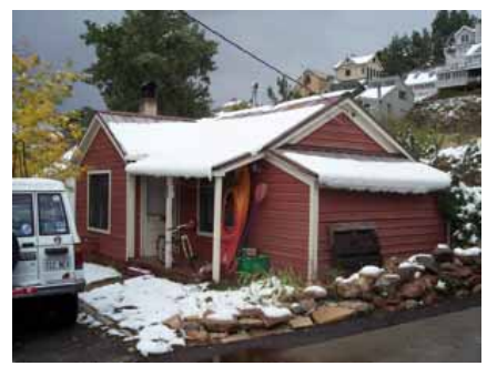
270 GRANT AVENUE Landmark Site Designated Feb. 4, 2009