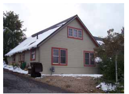
218 SANDRIDGE AVENUE Significant Site Designated Feb. 4, 2009