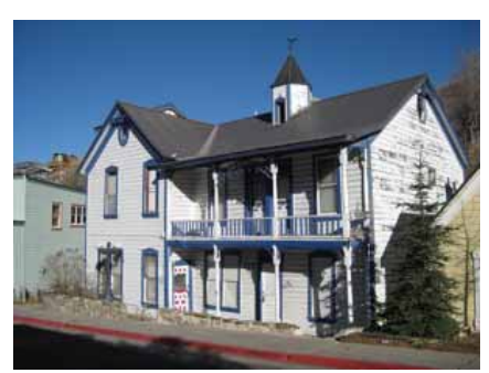
176 MAIN STREET Landmark Site Designated Feb. 4, 2009