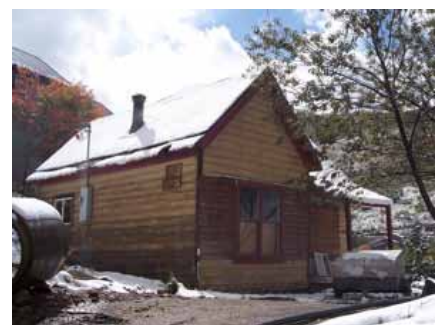
68 PROSPECT STREET Landmark Site Designated Feb. 4, 2009