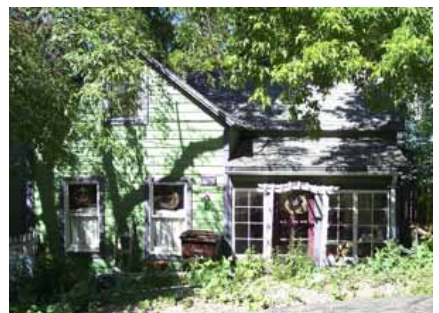
1010 WOODSIDE AVENUE Landmark Site Designated Feb. 4, 2009