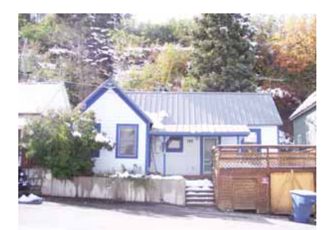
162 DALY AVENUE Landmark Site Designated Feb. 4, 2009