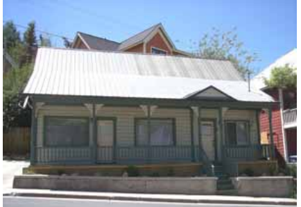
115 MAIN STREET Significant Site Designated Feb. 4, 2009