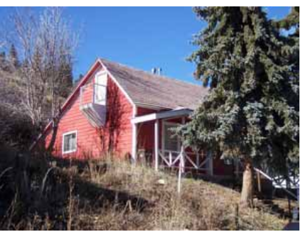
335 WOODSIDE AVENUE Landmark Site Designated Feb. 4, 2009