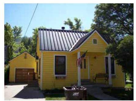
1445 WOODSIDE AVENUE Significant Site Designated Feb. 4, 2009