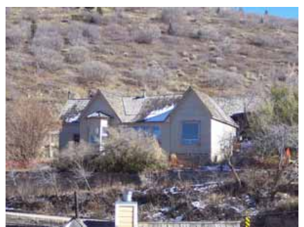
9 HILLSIDE AVENUE (pre-reconstruction) Significant Site Designated Feb. 4, 2009