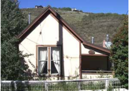
1158 WOODSIDE AVENUE Significant Site Designated Feb. 4, 2009