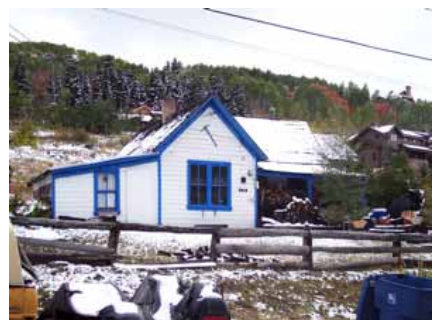
622 ROSSIE HILL DRVIE Landmark Site Designated Feb. 4, 2009