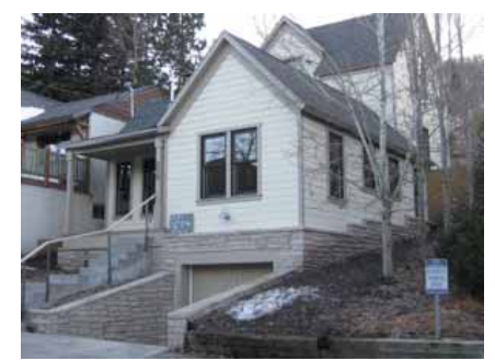
1013 WOODSIDE AVENUE Significant Site Designated Feb. 4, 2009