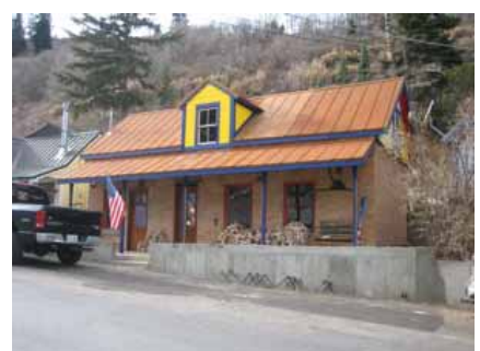
166 DALY AVENUE Landmark Site Designated Feb. 4, 2009