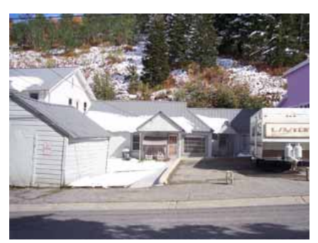
173 DALY AVENUE Significant Site Designated Feb. 4, 2009