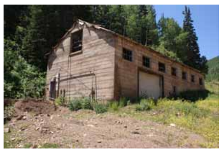
SILVER KING MINE CHANGE HOUSE Significant Site Designated Feb. 4, 2009