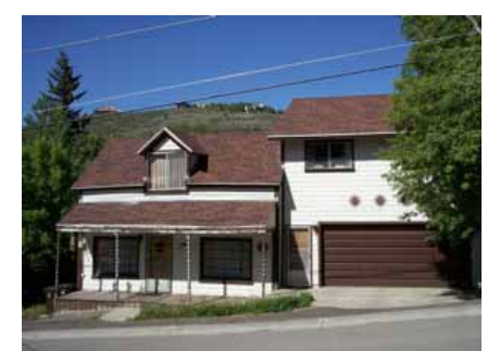
1020 WOODSIDE AVENUE Significant Site Designated Feb. 4, 2009