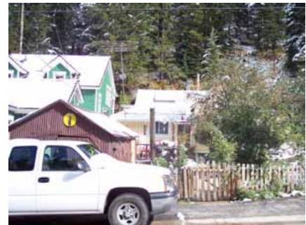
257 DALY AVENUE Significant Site Designated Feb. 4, 2009