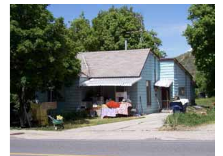
1460 PARK AVENUE Significant Site Designated Feb. 4, 2009