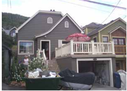
1009 NORFOLK AVENUE Significant Site Designated Feb. 4, 2009