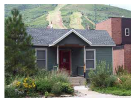
1333 PARK AVENUE Landmark Site Designated Feb. 4, 2009