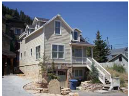
563 WOODSIDE AVENUE Significant Site Designated Feb. 4, 2009