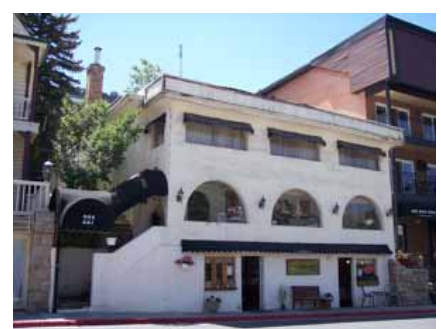
227 MAIN STREET Significant Site Designated Feb. 4, 2009