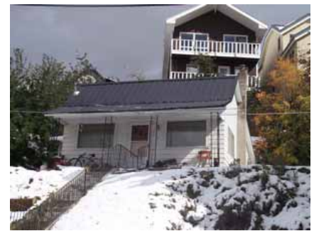
37 HILLSIDE AVENUE Significant Site Designated Feb. 4, 2009