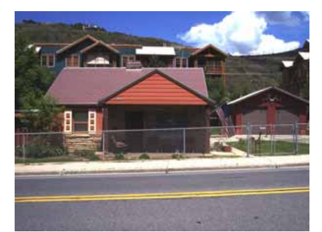
1060 PARK AVENUE Landmark Site Designated Feb. 4, 2009