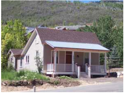
1895 THREE KINGS DRIVE Landmark Site Designated Feb. 4, 2009

1825 THREE KINGS DRIVE SPIRO TUNNEL MINES Significant Site Designated Apr. 7, 2010 See Mine Sites