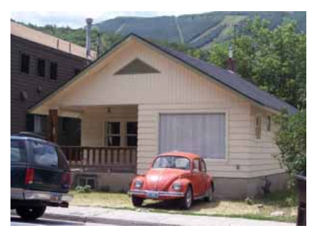
1323 PARK AVENUE Significant Site Designated Feb. 4, 2009