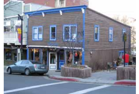
562 MAIN STREET Landmark Site Designated Feb. 4, 2009