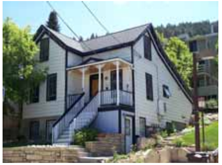
463 PARK AVENUE Landmark Site Designated Feb. 4, 2009