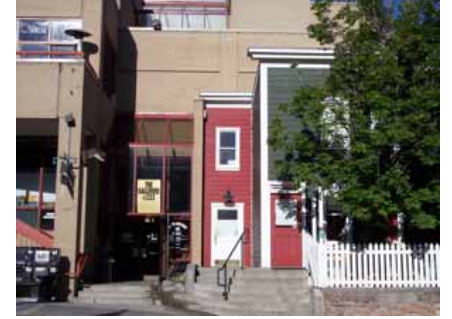
347 MAIN STREET Significant Site Designated Feb. 4, 2009