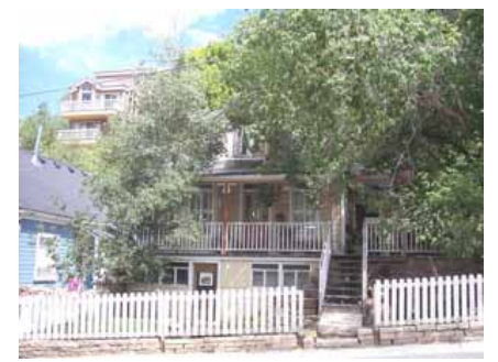
338 MARSAC AVENUE Significant Site Designated Feb. 4, 2009