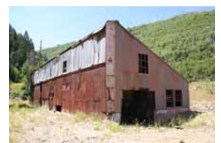
ALLIANCE POWER HOUSE Significant Site Designated March 17, 2010