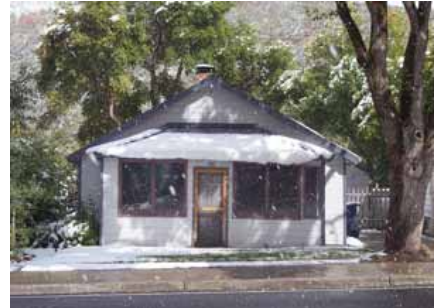
1114 PARK AVENUE Significant Site Designated Feb. 4, 2009