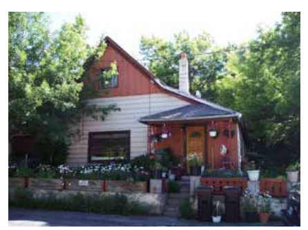
909 WOODSIDE AVENUE Significant Site Designated Feb. 4, 2009