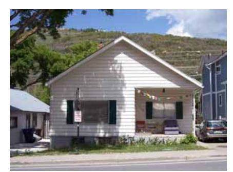
1108 PARK AVENUE Significant Site Designated Feb. 4, 2009