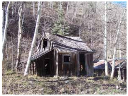
360 DALY AVENUE Significant Site Designated Feb. 4, 2009

314 DALY AVENUE Landmark Site Designated Feb. 4, 2009