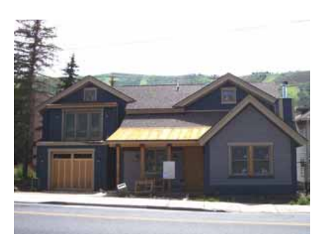
1359 PARK AVENUE Significant Site Designated Feb. 4, 2009