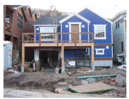
1021 NORFOLK AVENUE Significant Site Designated Feb. 4, 2009