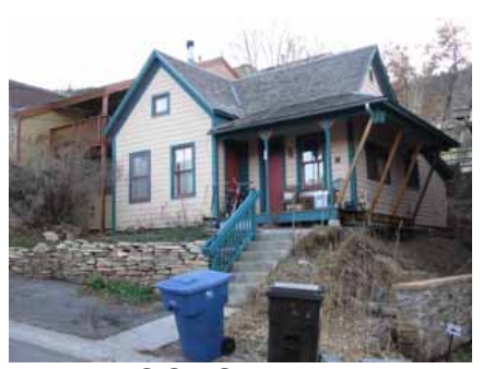
951 WOODSIDE AVENUE Landmark Site Designated Feb. 4, 2009