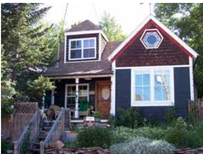
827 WOODSIDE AVENUE Significant Site Designated Feb. 4, 2009