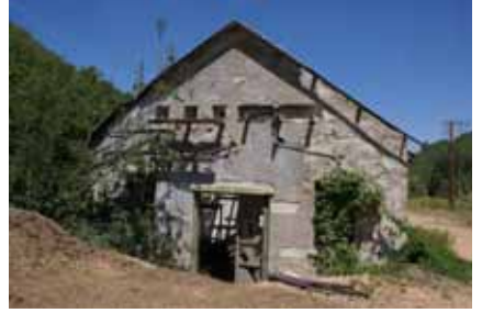
ALLIANCE POWER HOUSE Significant Site Designated March 17, 2010