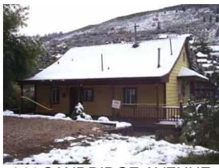
244 SANDRIDGE AVENUE Significant Site Designated Feb. 4, 2009