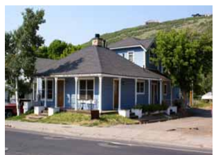
1102 PARK AVENUE Significant Site Designated Feb. 4, 2009