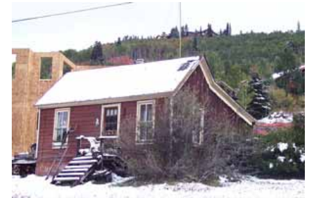
660 ROSSIE HLL DRIVE Landmark Site Designated Feb. 4, 2009