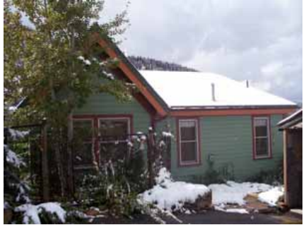
228 SANDRIDGE AVENUE Significant Site Designated Feb. 4, 2009