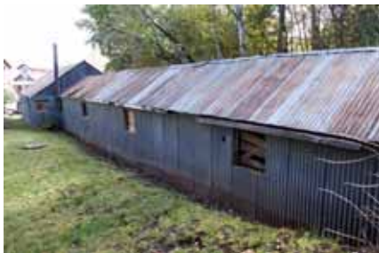
SPIRO - IVERS TUNNEL Significant Site Designated April 7, 2010