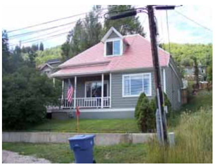
1063 EMPIRE AVENUE Significant Site Designated Feb. 4, 2009