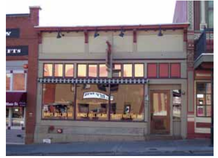
440 MAIN STREET Landmark Site Designated Feb. 4, 2009