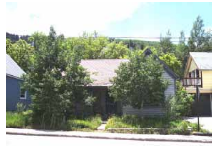
929 PARK AVENUE Significant Site Designated Feb. 4, 2009