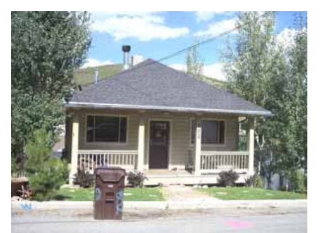
802 NORFOLK AVENUE Landmark Site Designated Feb. 4, 2009