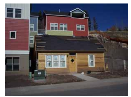
577 Deer Valley Drive Significant Site Designated Feb. 4, 2009