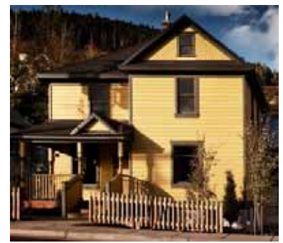
703 PARK AVENUE Landmark Site Designated Feb. 4, 2009