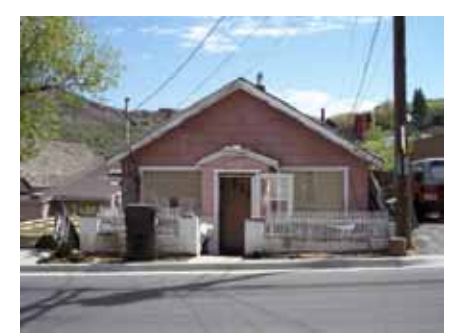
430 PARK AVENUE (Pre-Disassembly) Significant Site Designated Feb. 4, 2009