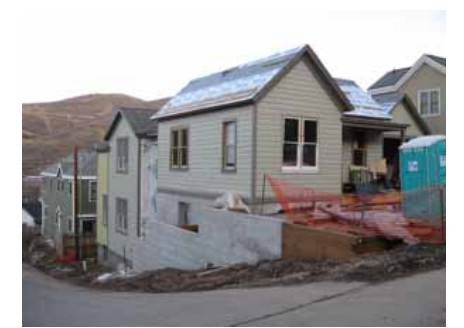
964 EMPIRE AVENUE Significant Site Designated Feb. 4, 2009