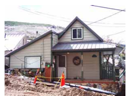
52 PROSPECT STREET Significant Site Designated Feb. 4, 2009