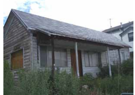
1004 EMPIRE AVENUE Significant Site Designated Feb. 4, 2009