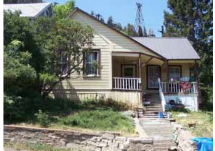
655 WOODSIDE AVENUE Landmark Site Designated Feb. 4, 2009