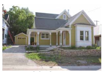
1053 WOODSIDE AVENUE Significant Site Designated Feb. 4, 2009