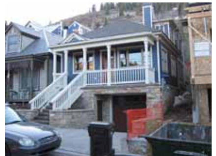
411 PARK AVENUE Significant Site Designated Feb. 4, 2009

Sites listed alphabetically by street name then numerically by building number. Only Main Building shown - see individual Historic Site Form for Accessory Buildings and/or Structures on the site. Date HPB designated site to the HSI.