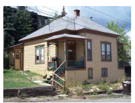
911 EMPIRE AVENUE Landmark Site Designated Feb. 4, 2009