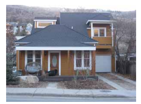
1135 PARK AVENUE Significant Site Designated Feb. 4, 2009