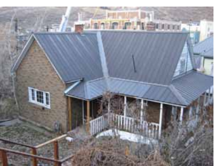
664 WOODSIDE AVENUE Significant Site Designated Feb. 4, 2009