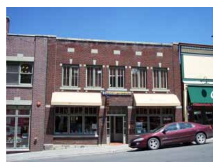
312 MAIN STREET Landmark Site Designated Feb. 4, 2009