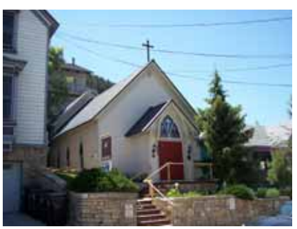
525 PARK AVENUE Landmark Site Designated Feb. 4, 2009

517 PARK AVENUE Landmark Site Designated Feb. 4, 2009