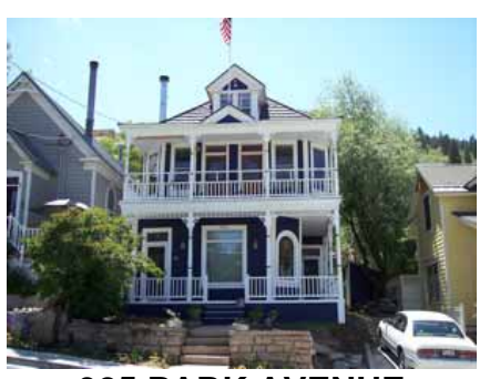
325 PARK AVENUE Landmark Site Designated Feb. 4, 2009