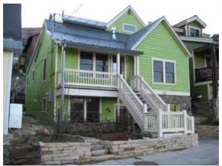
139 WOODSIDE AVENUE Significant Site Designated Feb. 4, 2009