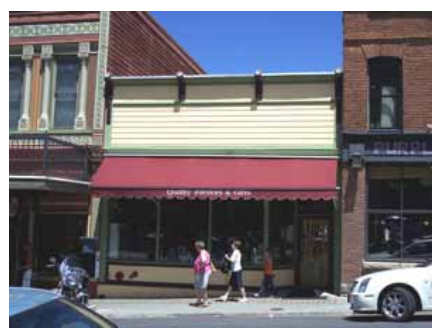
436 MAIN STREET Landmark Site Designated Feb. 4, 2009