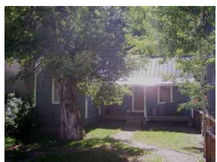
131 DALY AVENUE Landmark Site Designated Feb. 4, 2009