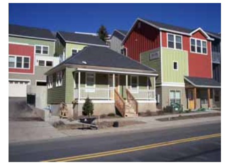
555 Deer Valley Drive Significant Site Designated Feb. 4, 2009