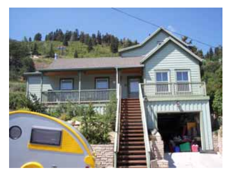
347 WOODSIDE AVENUE Significant Site Designated Feb. 4, 2009