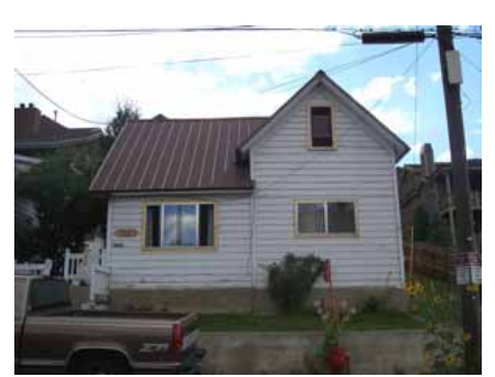
1063 NORFOLK AVENUE Significant Site Designated Feb. 4, 2009