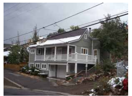
250 GRANT AVENUE Significant Site Designated Feb. 4, 2009