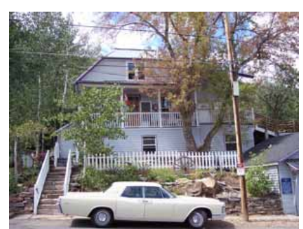
1011 EMPIRE AVENUE Significant Site Designated Feb. 4, 2009