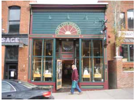
430 MAIN STREET Landmark Site Designated Feb. 4, 2009