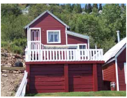
401 WOODSIDE AVENUE Significant Site Designated Feb. 4, 2009