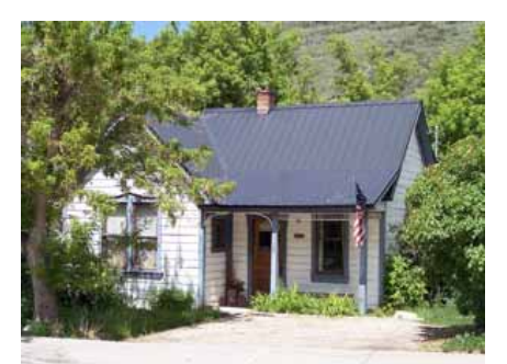
1128 PARK AVENUE Landmark Site Designated Feb. 4, 2009