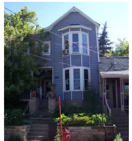
901 WOODSIDE AVENUE Landmark Site Designated Feb. 4, 2009