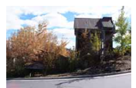
SPIRO TUNNEL COAL HOPPER/BOILER Significant Site Designated April 7, 2010