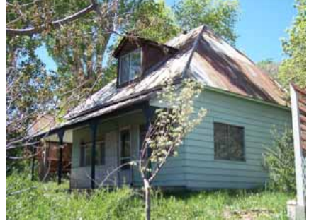
115 SAMPSON AVENUE Significant Site Designated Feb. 4, 2009