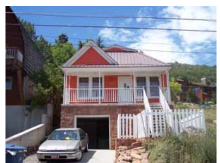
963 EMPIRE AVENUE Significant Site Designated Feb. 4, 2009