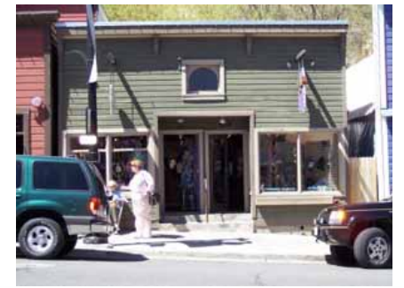
511 MAIN STREET Landmark Site Designated Feb. 4, 2009