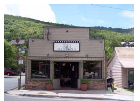
1101 PARK AVENUE Significant Site Designated Feb. 4, 2009