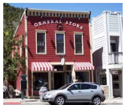
541 MAIN STREET Landmark Site Designated Feb. 4, 2009