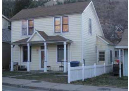
1049 PARK AVENUE Landmark Site Designated Feb. 4, 2009