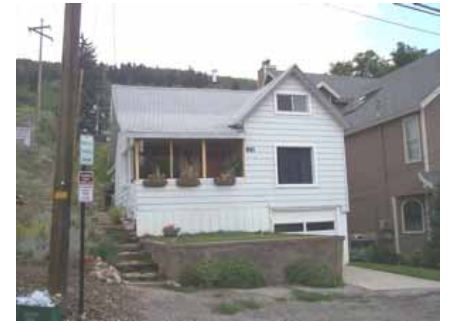
901 NORFOLK AVENUE Significant Site Designated Feb. 4, 2009