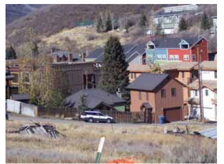
595 DEER VALLEY LOOP Significant Site Designated Feb. 4, 2009