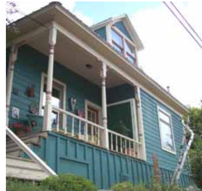
355 ONTARIO AVENUE Landmark Site Designated Feb. 4, 2009