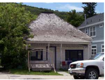
1021 PARK AVENUE Landmark Site Designated Feb. 4, 2009

1015 PARK AVENUE Significant Site Designated Feb. 4, 2009