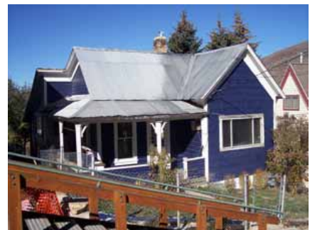
1002.5 NORFOLK AVENUE Landmark Site Designated Feb. 4, 2009