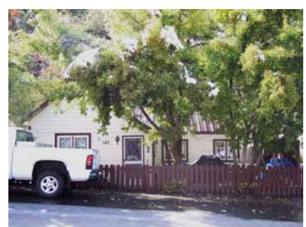
180 DALY AVENUE Significant Site Designated Feb. 4, 2009