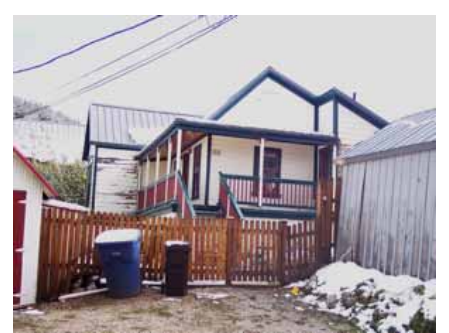
33 KING ROAD Landmark Site Designated Feb. 4, 2009

Sites listed alphabetically by street name then numerically by building number. Only Main Building shown - see individual Historic Site Form for Accessory Buildings and/or Structures on the site. Date HPB designated site to the HSI.