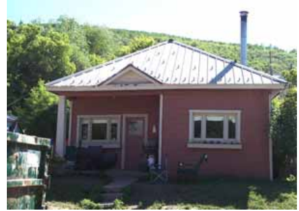
1057 WOODSIDE AVENUE Landmark Site Designated Feb. 4, 2009