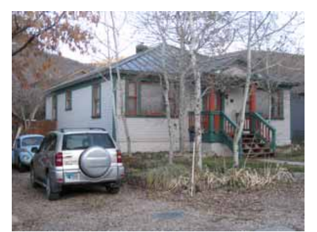
1110 WOODSIDE AVENUE Landmark Site Designated Feb. 4, 2009