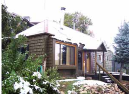
16 SAMPSON AVENUE Significant Site Designated Feb. 4, 2009