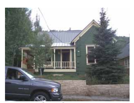
933 NORFOLK AVENUE Landmark Site Designated Feb. 4, 2009