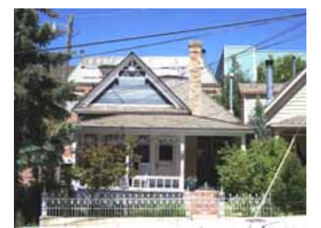
614 PARK AVENUE Landmark Site Designated Feb. 4, 2009