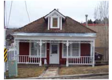
364 PARK AVENUE Significant Site Designated Feb. 4, 2009