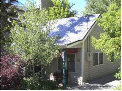
1026 WOODSIDE AVENUE Landmark Site Designated Feb. 4, 2009