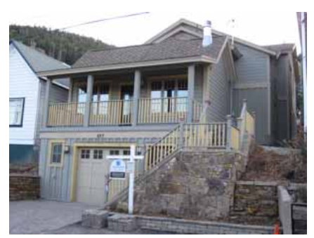
827 NORFOLK AVENUE Significant Site Designated Feb. 4, 2009