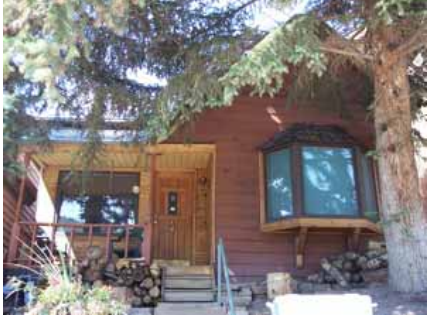
149 WOODSIDE AVENUE Significant Site Designated Feb. 4, 2009