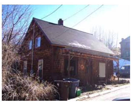
81 KING ROAD Significant Site Designated Feb. 4, 2009