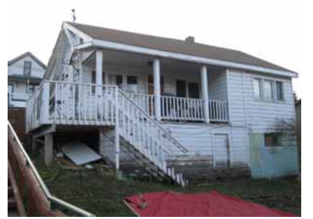
1102 NORFOLK AVENUE Landmark Site Designated Feb. 4, 2009