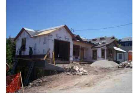
1002 NORFOLK AVENUE Significant Site Designated Feb. 4, 2009