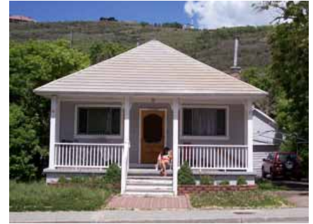
1150 PARK AVENUE Landmark Site Designated Feb. 4, 2009