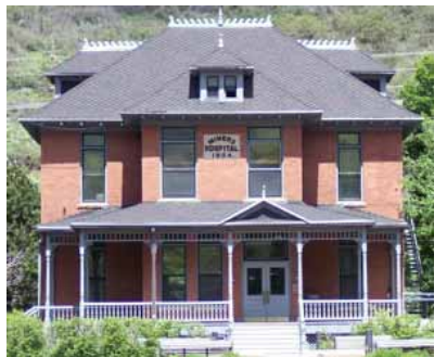
1354 PARK AVENUE Landmark Site Designated Feb. 4, 2009