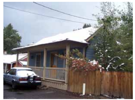
262 GRANT AVENUE Significant Site Designated Feb. 4, 2009