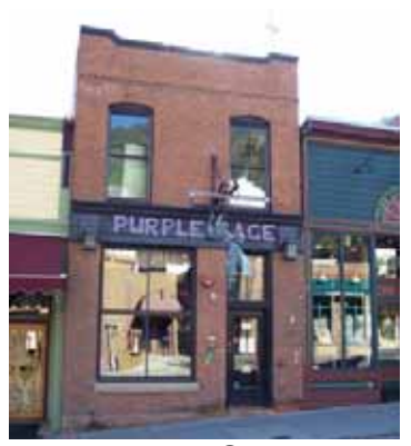
434 MAIN STREET Landmark Site Designated Feb. 4, 2009