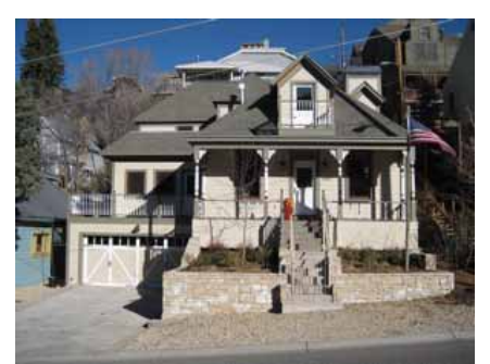
402 MARSAC AVENUE Significant Site Designated Feb. 4, 2009