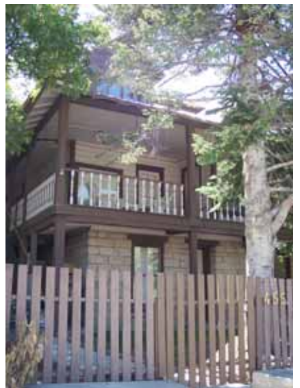
455 PARK AVENUE Landmark Site Designated Feb. 4, 2009