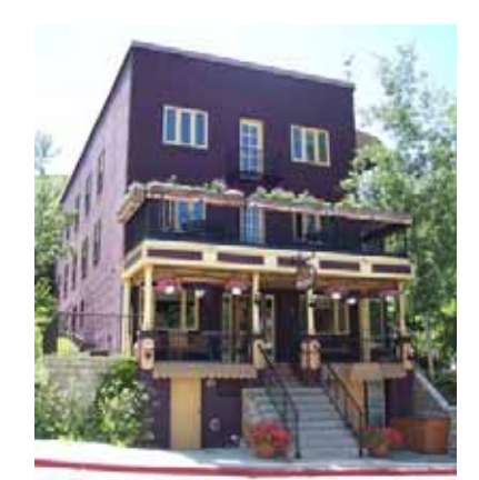
151 MAIN STREET Landmark Site Designated Feb. 4, 2009