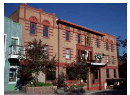
573 MAIN STREET Landmark Site Designated Feb. 4, 2009