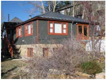
308 ONTARIO AVENUE Significant Site Designated Feb. 4, 2009