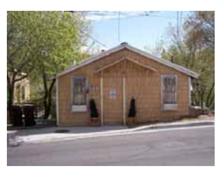
526 PARK AVENUE Significant Site Designated Feb. 4, 2009