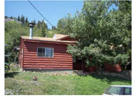
429 WOODSIDE AVENUE (pre-construction) Significant Site Designated Feb. 4, 2009