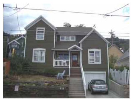
835 NORFOLK AVENUE Significant Site Designated Feb. 4, 2009