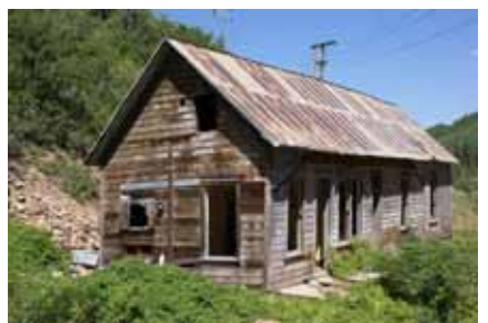
ALLIANCE OFFICE/DWELLING Significant Site Designated March 17, 2010