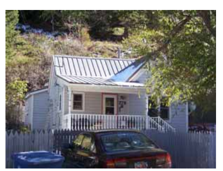
279 DALY AVENUE Landmark Site Designated Feb. 4, 2009