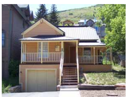
157 PARK AVENUE Landmark Site Designated Feb. 4, 2009