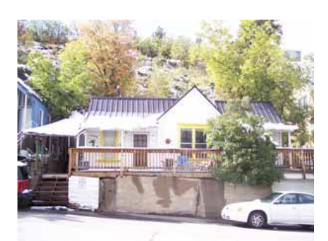
142 DALY AVENUE Landmark Site Designated Feb. 4, 2009