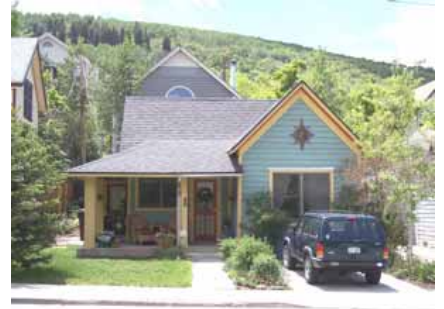
943 PARK AVENUE Landmark Site Designated Feb. 4, 2009