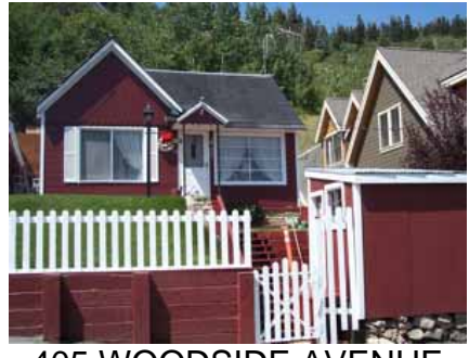
405 WOODSIDE AVENUE Significant Site Designated Feb. 4, 2009