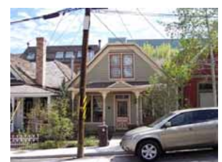
610 PARK AVENUE Landmark Site Designated Feb. 4, 2009