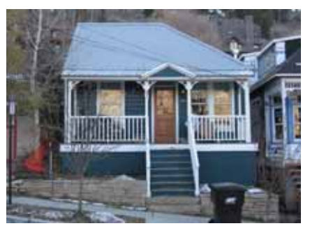
553 PARK AVENUE Landmark Site Designated Feb. 4, 2009