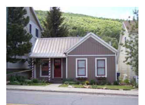
1043 PARK AVENUE Significant Site Designated Feb. 4, 2009