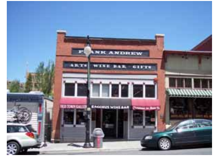
442 MAIN STREET Significant Site Designated Feb. 4, 2009