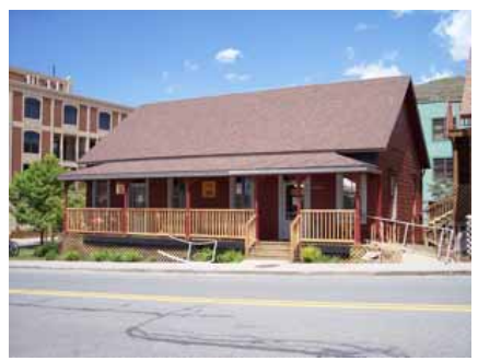
698 PARK AVENUE Landmark Site Designated Feb. 4, 2009