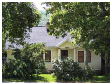
1503 PARK AVENUE Landmark Site Designated Feb. 4, 2009