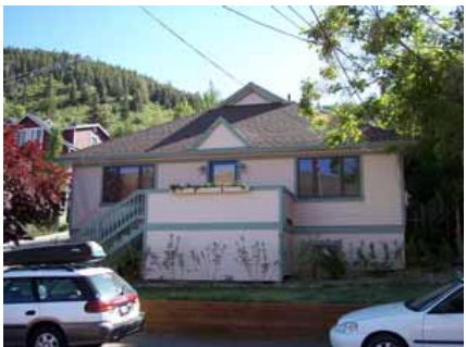
805 WOODSIDE AVENUE Significant Site Designated Feb. 4, 2009