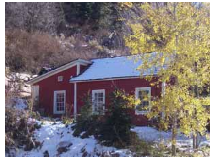
97 DALY AVENUE Landmark Site Designated Feb. 4, 2009