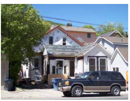
909 PARK AVENUE Significant Site Designated Feb. 4, 2009

820 PARK AVENUE Significant Site Designated Feb. 4, 2009