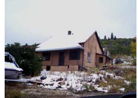
632 DEER VALLEY LOOP Significant Site Designated Feb. 4, 2009