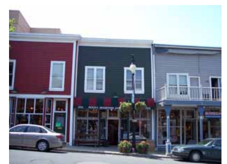
359 MAIN STREET Significant Site Designated Feb. 4, 2009