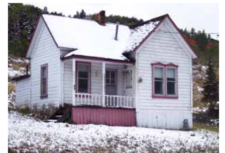
652 ROSSIE HILL DRIVE Landmark Site Designated Feb. 4, 2009