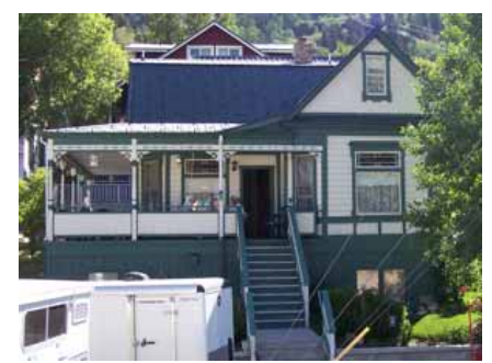
733 WOODSIDE AVENUE Significant Site Designated Feb. 4, 2009