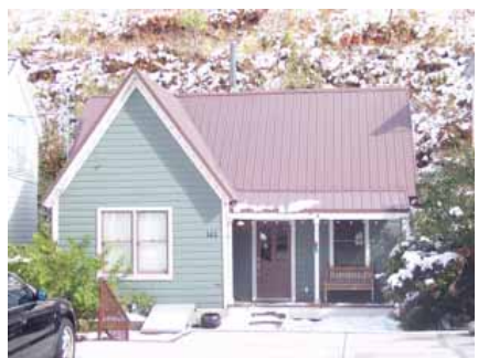
161 DALY AVENUE Significant Site Designated Feb. 4, 2009