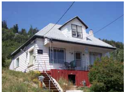
359 WOODSIDE AVENUE Significant Site Designated Feb. 4, 2009