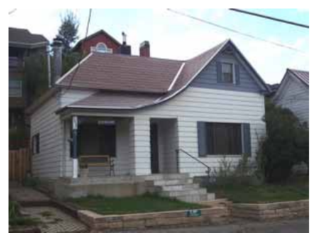
1055 NORFOLK AVENUE Significant Site Designated Feb. 4, 2009