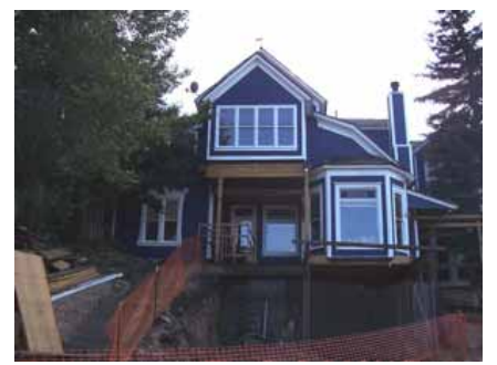
713 NORFOLK AVENUE Significant Site Designated Feb. 4, 2009