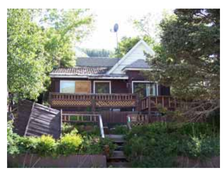
919 WOODSIDE AVENUE Significant Site Designated Feb. 4, 2009