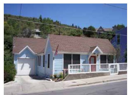
158 MAIN STREET Significant Site Designated Feb. 4, 2009