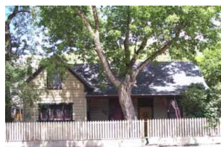
1304 PARK AVENUE Landmark Site Designated Feb. 4, 2009