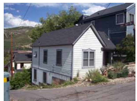
962 NORFOLK AVENUE Landmark Site Designated Feb. 4, 2009