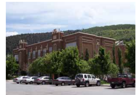
1255 PARK AVENUE Landmark Site Designated Feb. 4, 2009