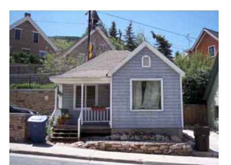
109 Main Street Significant Site Designated Feb. 4, 2009