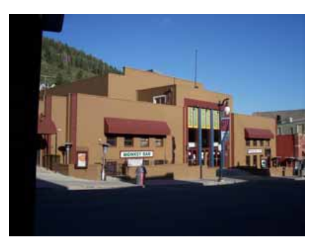
427 MAIN STREET Landmark Site Designated Feb. 4, 2009