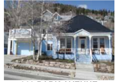
363 PARK AVENUE Landmark Site Designated Feb. 4, 2009