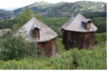
SILVER KING MINE WATER TANK A & B Significant Site Designated Feb. 4, 2009