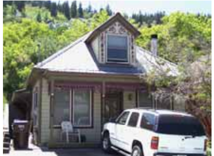
401 PARK AVENUE Landmark Site Designated Feb. 4, 2009