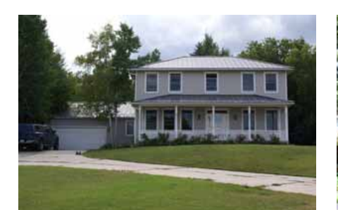
175 SNOW'S LANE Significant Site Designated Oct. 7, 2009