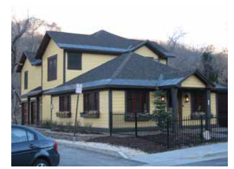
1160 PARK AVENUE Significant Site Designated Feb. 4, 2009