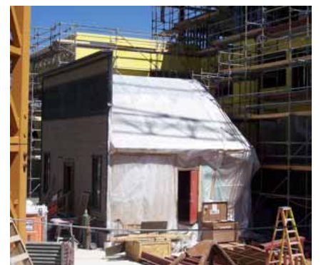
199 HEBER AVENUE Significant Site Designated Feb. 4, 2009