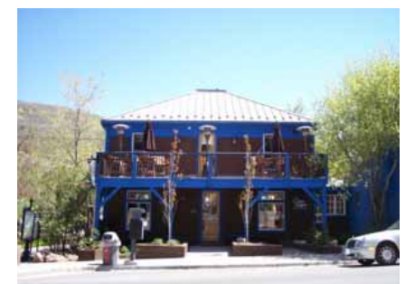
558 MAIN STREET Significant Site Designated Feb. 4, 2009