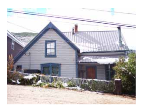
22 PROSPECT STREET Landmark Site Designated Feb. 4, 2009