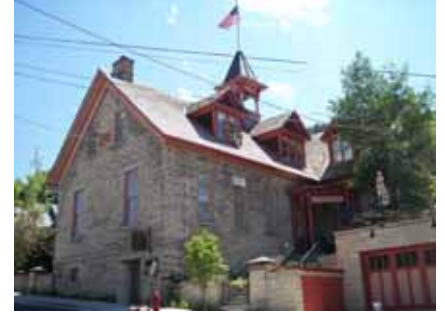
543 PARK AVENUE Landmark Site Designated Feb. 4, 2009