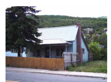
1149 PARK AVENUE Significant Site Designated Feb. 4, 2009