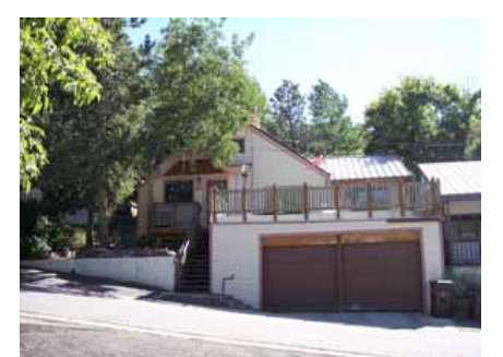
1007 WOODSIDE AVENUE Significant Site Designated Feb. 4, 2009