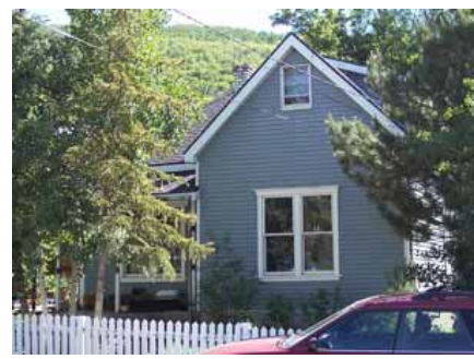
1147 WOODSIDE AVENUE Significant Site Designated Feb. 4, 2009