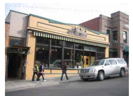
350 MAIN STREET Landmark Site Designated Feb. 4, 2009