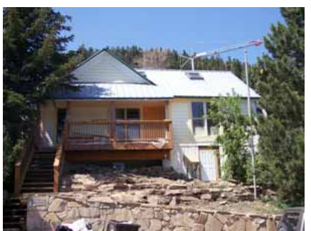
505 WOODSIDE AVENUE Significant Site Designated Feb. 4, 2009