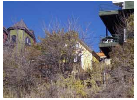
252 MARSAC AVENUE Landmark Site Designated Feb. 4, 2009