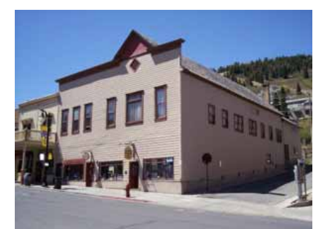
461-463 MAIN STREET Significant Site Designated Feb. 4, 2009