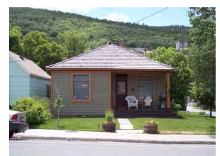
1063 PARK AVENUE Landmark Site Designated Feb. 4, 2009