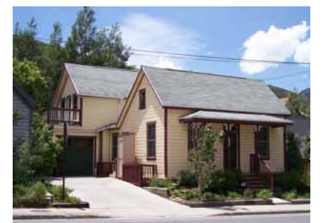
937 PARK AVENUE Significant Site Designated Feb. 4, 2009