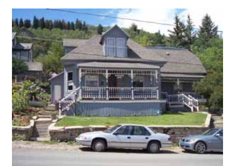
939 EMPIRE AVENUE Landmark Site Designated Feb. 4, 2009