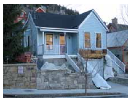
527 PARK AVENUE Significant Site Designated Feb. 4, 2009