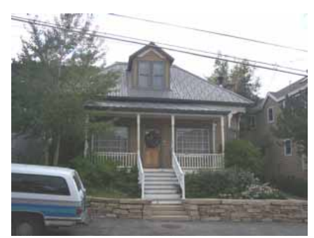
955 NORFOLK AVENUE Landmark Site Designated Feb. 4, 2009