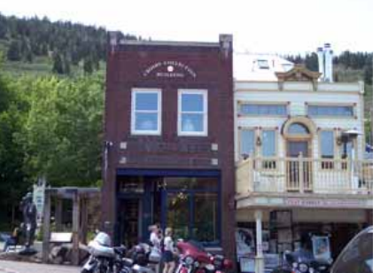
419 MAIN STREET Landmark Site Designated Feb. 4, 2009