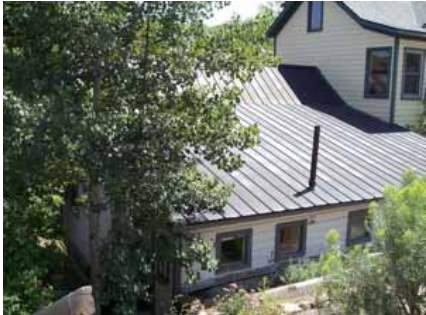
424 WOODSIDE AVENUE Significant Site Designated Feb. 4, 2009