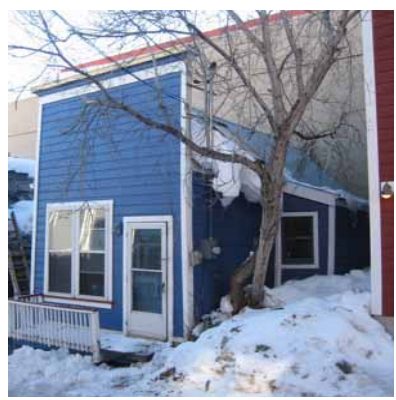
361 ½ MAIN STREET Significant Site Designated Feb. 4, 2009