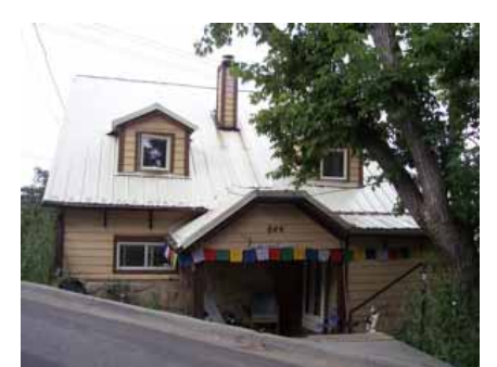
844 EMPIRE AVENUE Significant Site Designated Feb. 4, 2009