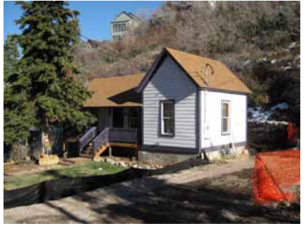
71 DALY AVENUE Significant Site Designated Feb. 4, 2009