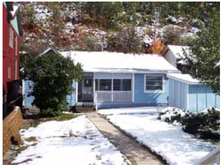
61 DALY AVENUE Landmark Site Designated Feb. 4, 2009