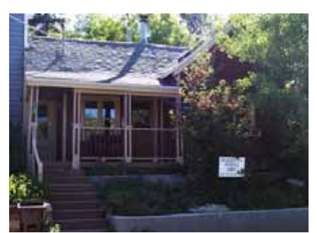
905 WOODSIDE AVENUE Significant Site Designated Feb. 4, 2009