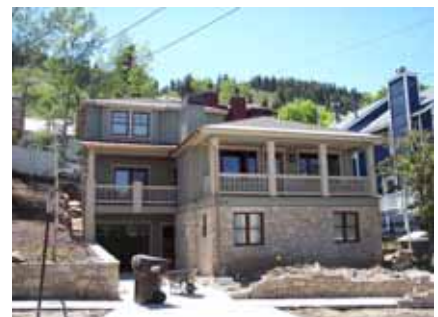
435 PARK AVENUE Significant Site Designated Feb. 4, 2009