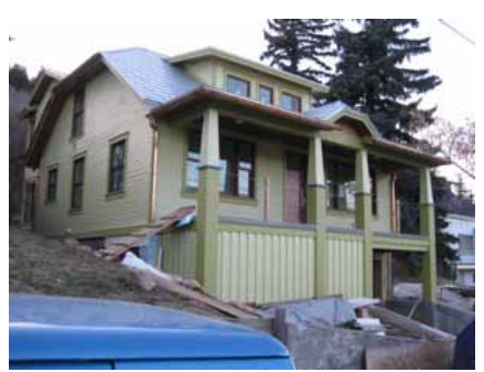
841 EMPIRE AVENUE Significant Site Designated Feb. 4, 2009