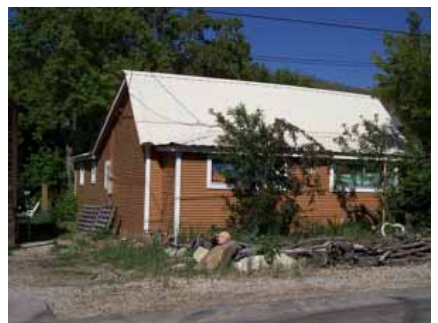
1120 WOODSIDE AVENUE Significant Site Designated Feb. 4, 2009