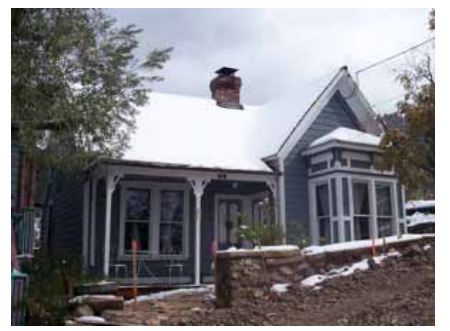
59 PROSPECT STREET Landmark Site Designated Feb. 4, 2009