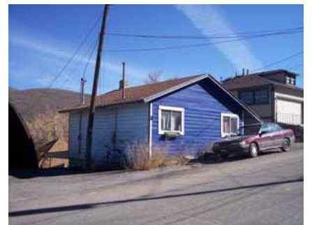
920 EMPIRE AVENUE Significant Site Designated Feb. 4, 2009