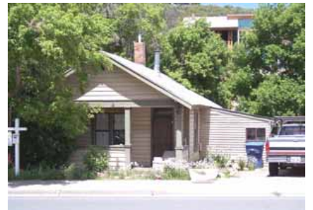
1062 PARK AVENUE Landmark Site Designated Feb. 4, 2009