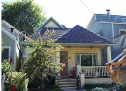
1107 WOODSIDE AVENUE Signficant Site Designated Feb. 4, 2009