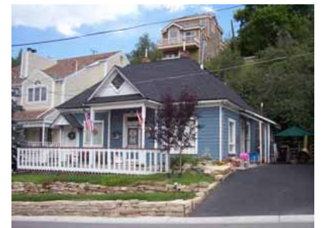
342 MARSAC AVENUE Landmark Site Designated Feb. 4, 2009