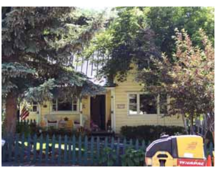
1127 WOODSIDE AVENUE Landmark Site Designated Feb. 4, 2009