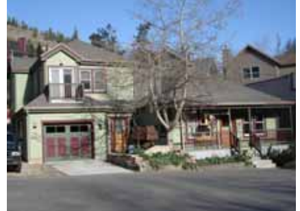
10 DALY AVENUE Significant Site Designated Feb. 4, 2009