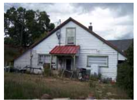
44 CHAMBERS AVENUE Landmark Site Designated Feb. 4, 2009