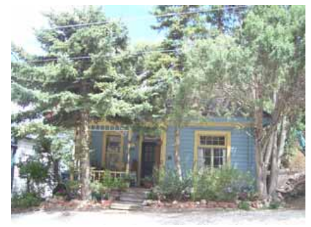
412 MARSAC AVENUE Landmark Site Designated Feb. 4, 2009