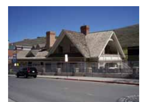
660 MAIN STREET Landmark Site Designated Feb. 4, 2009