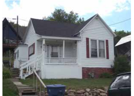
811 NORFOLK AVENUE Landmark Site Designated Feb. 4, 2009