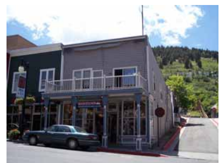
361 MAIN STREET Landmark Site Designated Feb. 4, 2009