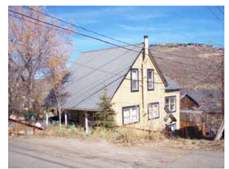
902 NORFOLK AVENUE Landmark Site Designated Feb. 4, 2009