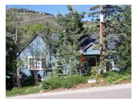
1002 WOODSIDE AVENUE Significant Site Designated Feb. 4, 2009