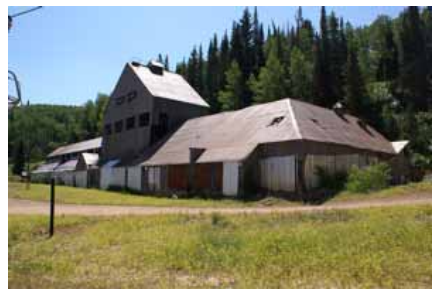
SILVER KING MINE SHAFT HOUSE Significant Site Designated Feb. 4, 2009