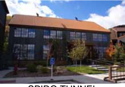
SPIRO TUNNEL MACHINE SHOP Significant Site Designated April 7, 2010