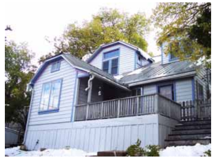
40 SAMPSON AVENUE Significant Site Designated Feb. 4, 2009