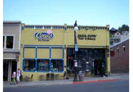
402 MAIN STREET Landmark Site Designated Feb. 4, 2009