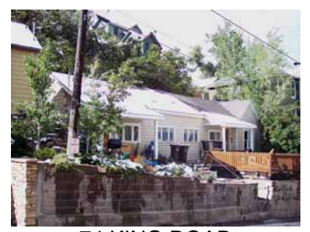
74 KING ROAD Landmark Site Designated Feb. 4, 2009