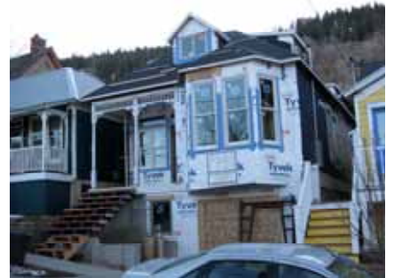
557 PARK AVENUE Significant Site Designated Feb. 4, 2009