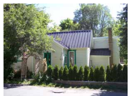
1439 WOODSIDE AVENUE Significant Site Designated Feb. 4, 2009