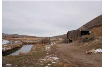
2780 KEARNS BOULEVARD Landmark Site Designated Feb. 4, 2009