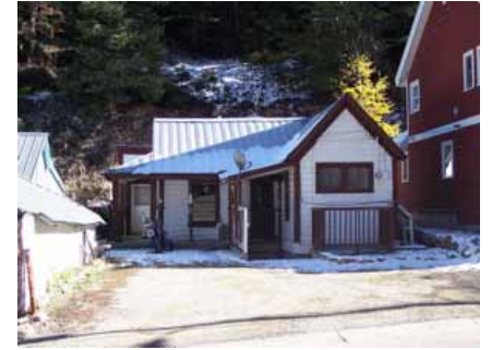
243 DALY AVENUE Landmark Site Designated Feb. 4, 2009