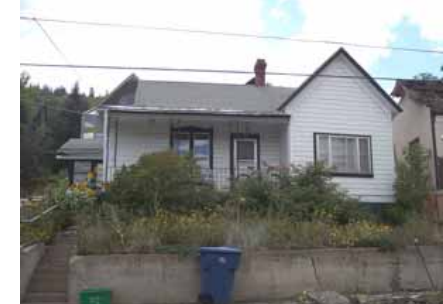
823 NORFOLK AVENUE Landmark Site Designated Feb. 4, 2009