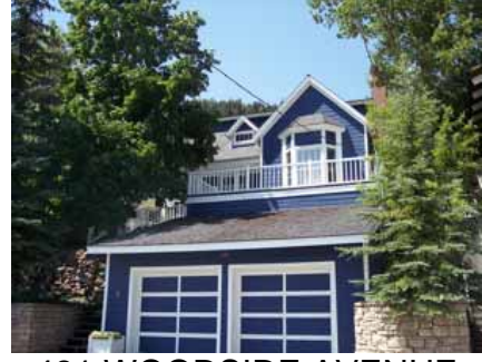
481 WOODSIDE AVENUE Significant Site Designated Feb. 4, 2009