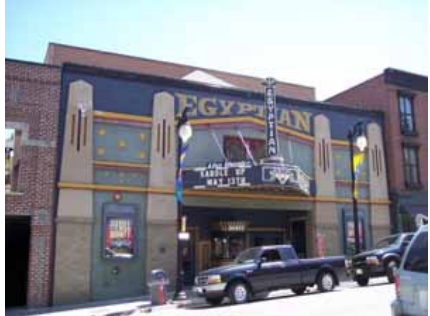
328 MAIN STREET Landmark Site Designated Feb. 4, 2009