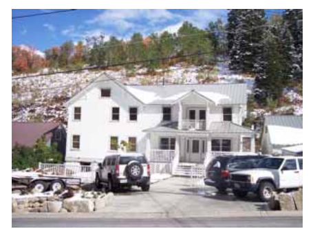
167 DALY AVENUE Significant Site Designated Feb. 4, 2009