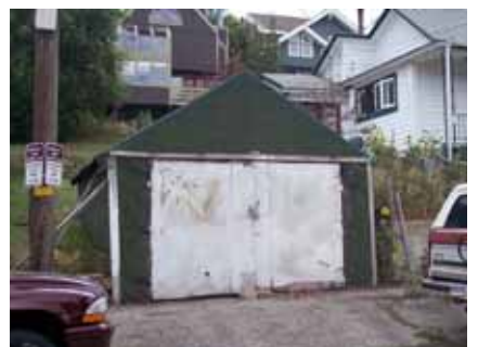
817 NORFOLK AVENUE Landmark Site Designated Aug. 4, 2010