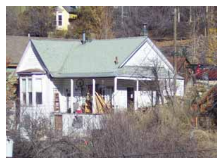
222 SANDRIDGE AVENUE Landmark Site Designated Feb. 4, 2009