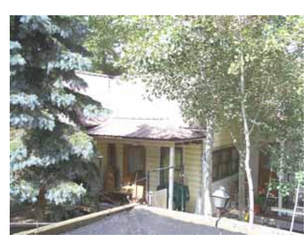
946 NORFOLK AVENUE Landmark Site Designated Feb. 4, 2009