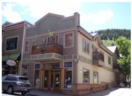
591 MAIN STREET Significant Site Designated Feb. 4, 2009