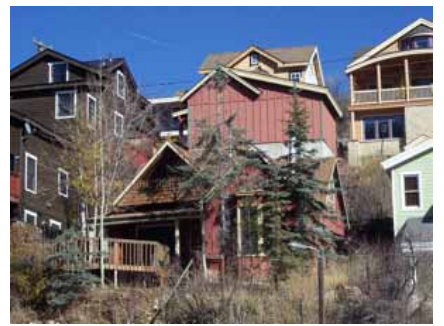
220 MARSAC AVENUE Significant Site Designated Feb. 4, 2009