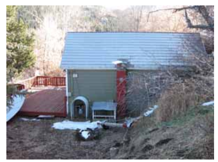
41 SAMPSON AVENUE Landmark Site Designated Feb. 4, 2009