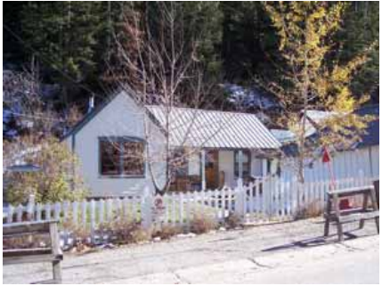
239 DALY AVENUE Significant Site Designated Feb. 4, 2009