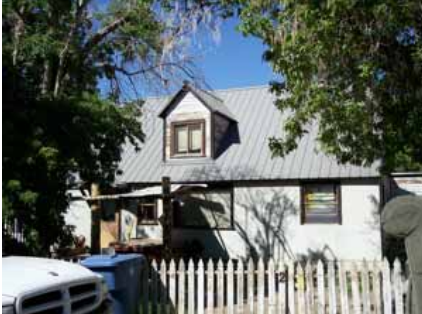
1060 WOODSIDE AVENUE Significant Site Designated Feb. 4, 2009