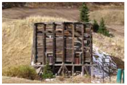
LITTLE BELLE ORE BIN Significant Site Designated March 17, 2010