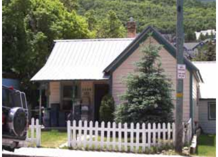
1125 PARK AVENUE Landmark Site Designated Feb. 4, 2009