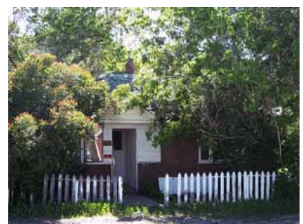
1323 WOODSIDE AVENUE (Pre-Disassembly) Significant Site Designated Feb. 4, 2009