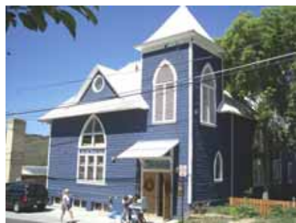
424 PARK AVENUE Landmark Site Designated Feb. 4, 2009