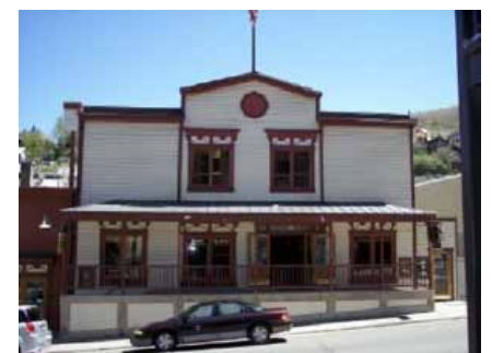
268 MAIN STREET Significant Site Designated Feb. 4, 2009