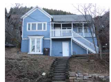
543 WOODSIDE AVENUE Significant Site Designated Feb. 4, 2009