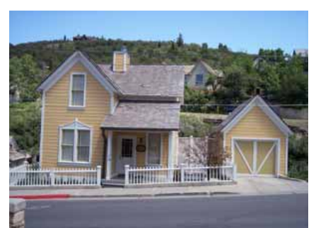
140 MAIN STREET Landmark Site Designated Feb. 4, 2009