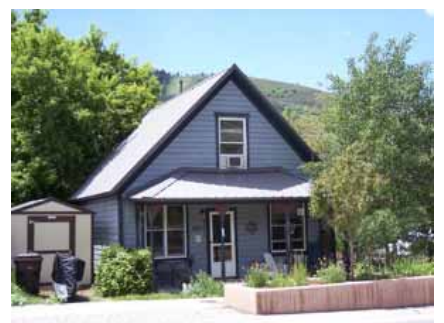
1215 PARK AVENUE Landmark Site Designated Feb. 4, 2009