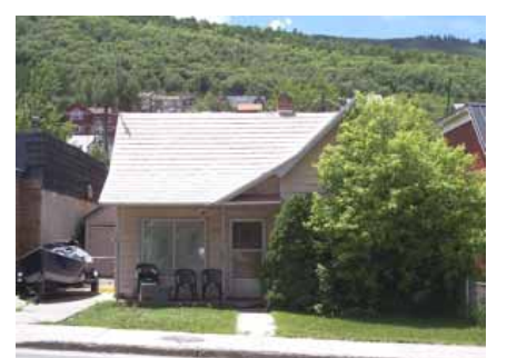
1109 PARK AVENUE Significant Site Designated Feb. 4, 2009