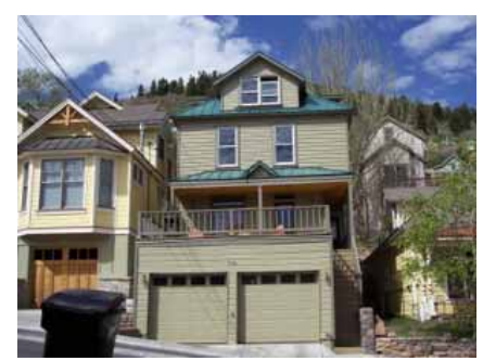
339 PARK AVENUE Significant Site Designated Feb. 4, 2009