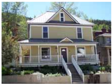
421 PARK AVENUE Landmark Site Designated Feb. 4, 2009

416 PARK AVENUE Landmark Site Designated Feb. 4, 2009