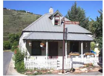
1162 WOODSIDE AVENUE Landmark Site Designated Feb. 4, 2009