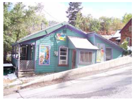
69 KING ROAD Landmark Site Designated Feb. 4, 2009