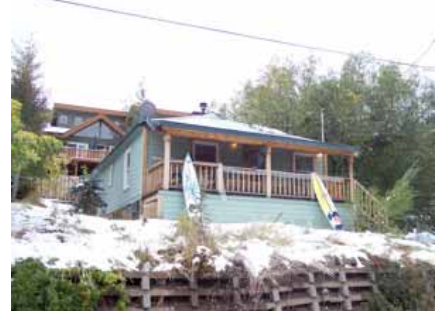
560 Deer Valley Drive Significant Site Designated Feb. 4, 2009