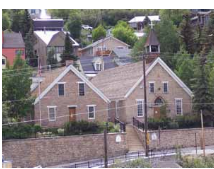
121 PARK AVENUE Landmark Site Designated Feb. 4, 2009