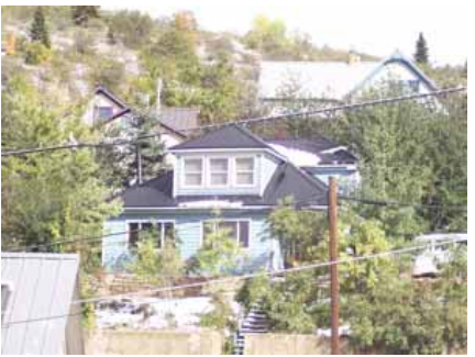
27 HILLSIDE AVENUE Landmark Site Designated Feb. 4, 2009