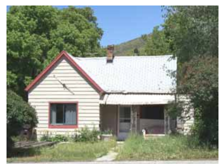
1450 PARK AVENUE Significant Site Designated Feb. 4, 2009