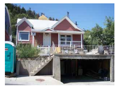
633 WOODSIDE AVENUE Significant Site Designated Feb. 4, 2009