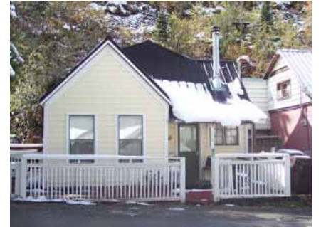
172 DALY AVENUE Significant Site Designated Feb. 4, 2009