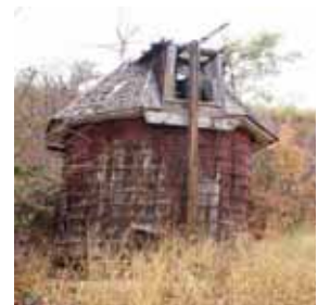
SPIRO TUNNEL WATER TANK A Significant Site Designated April 7, 2010