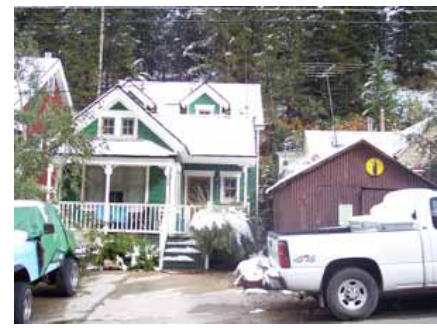
255 DALY AVENUE Significant Site Designated Feb. 4, 2009