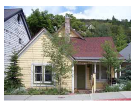
170 MAIN STREET Landmark Site Designated Feb. 4, 2009