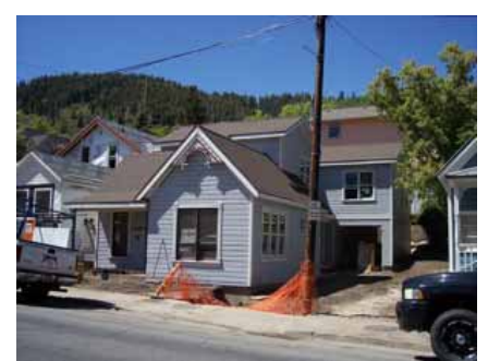
915 PARK AVENUE Significant Site Designated Feb. 4, 2009