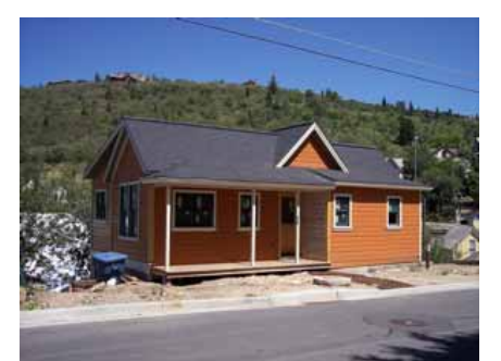
104 PARK AVENUE Significant Site Designated Feb. 4, 2009