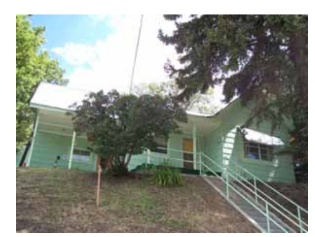
422 ONTARIO AVENUE Significant Site Designated Feb. 4, 2009