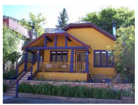
817 WOODSIDE AVENUE Landmark Site Designated Feb. 4, 2009