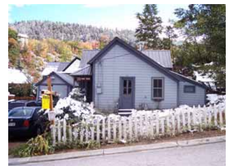
39 KING ROAD Landmark Site Designated Feb. 4, 2009