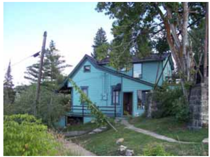
668 NORFOLK AVENUE Significant Site Designated Feb. 4, 2009