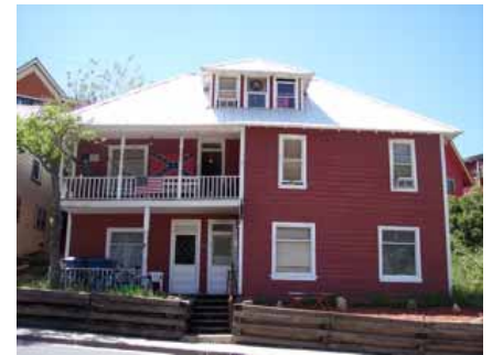
125 MAIN STREET Landmark Site Designated Feb. 4, 2009