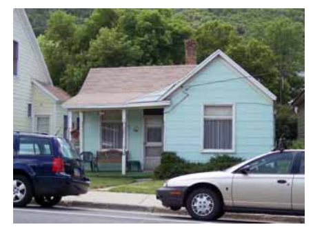
1059 PARK AVENUE Significant Site Designated Feb. 4, 2009