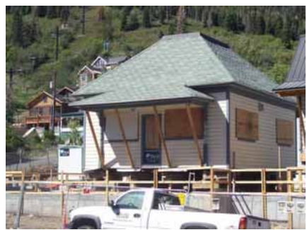
811 PARK AVENUE (Pre-rehabilitation) Significant Site Designated Feb. 4, 2009