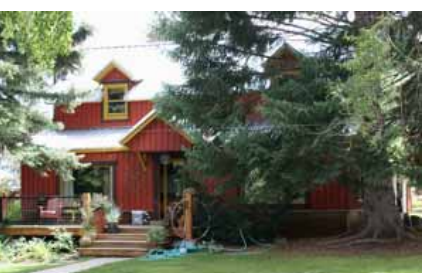
205 SNOW'S LANE Significant Site Designated Oct. 7, 2009