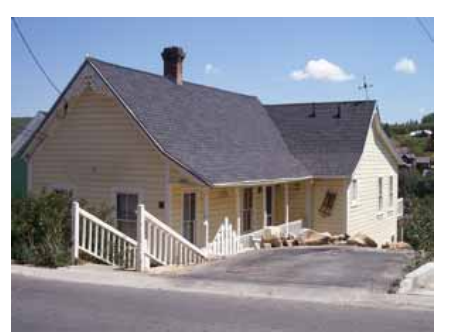
232 WOODSIDE AVENUE Landmark Site Designated Feb. 4, 2009