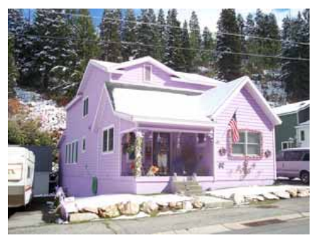
187 DALY AVENUE Significant Site Designated Feb. 4, 2009