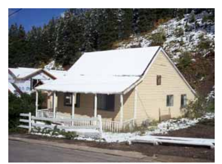
309 DALY AVENUE Significant Site Designated Feb. 4, 2009

297 DALY AVENUE Significant Site Designated Feb. 4, 2009