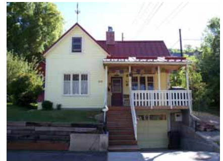
839 WOODSIDE AVENUE Landmark Site Designated Feb. 4, 2009