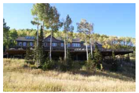
SILVER KING MINE BOARDING HOUSE Significant Site Designated Feb. 4, 2009