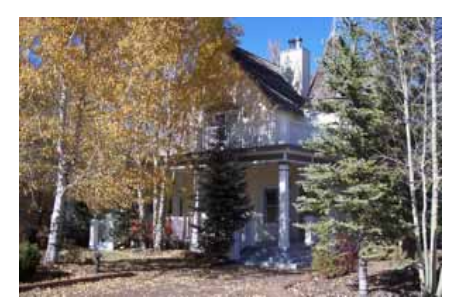
2245 MONITOR DRIVE Significant Site Designated Feb. 4, 2009