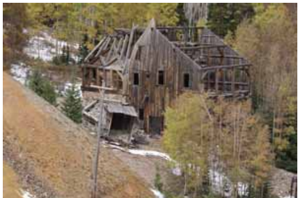
CALIFORNIA-COMSTOCK MILL BUILDING Significant Site Designated Feb. 4, 2009