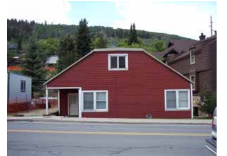
819 PARK AVENUE Significant Site Designated Feb. 4, 2009

Sites listed alphabetically by street name then numerically by building number. Only Main Building shown - see individual Historic Site Form for Accessory Buildings and/or Structures on the site. Date HPB designated site to the HSI.