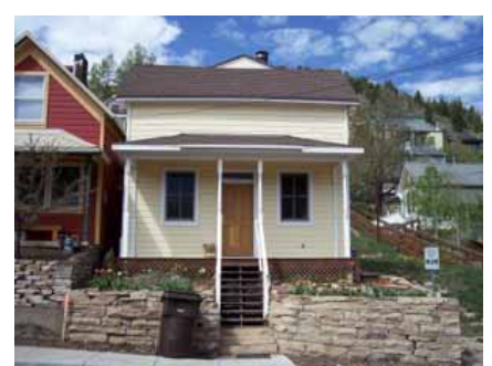
263 PARK AVENUE Significant Site Designated Feb. 4, 2009