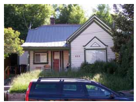
823 WOODSIDE AVENUE Significant Site Designated Feb. 4, 2009