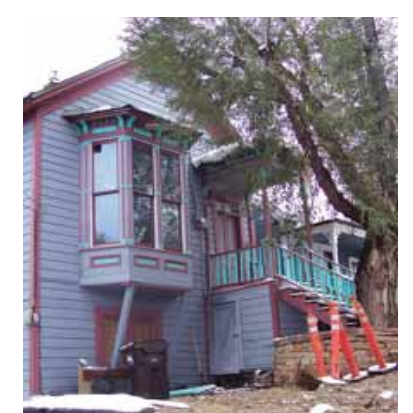
57 PROSPECT STREET Landmark Site Designated Feb. 4, 2009