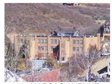
445 MARSAC AVENUE Landmark Site Designated Feb. 4, 2009