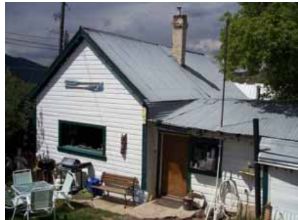
253 MCHENRY STREET Landmark Site Designated Feb. 4, 2009