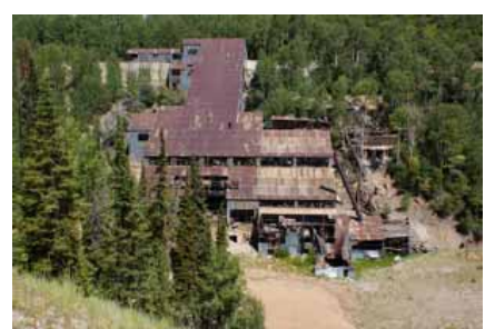
SILVER KING MINE MILL BUILDING Significant Site Designated Feb. 4, 2009