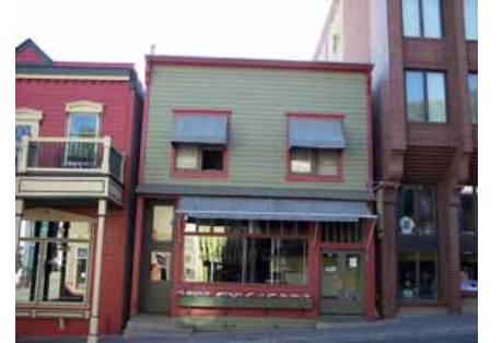
586 MAIN STREET Significant Site Designated Feb. 4, 2009