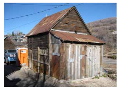
156 SANDRIDGE AVENUE (Accessory Building only) Significant Site Designated Feb. 4, 2009