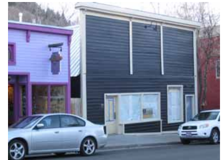
515 MAIN STREET Significant Site Designated Feb. 4, 2009