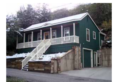
60 SAMPSON AVENUE Significant Site Designated Feb. 4, 2009