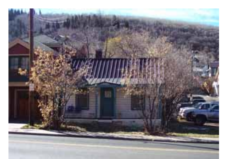
959 PARK AVENUE Landmark Site Designated Feb. 4, 2009

Sites listed alphabetically by street name then numerically by building number. Only Main Building shown - see individual Historic Site Form for Accessory Buildings and/or Structures on the site. Date HPB designated site to the HSI.