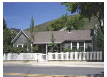
1266 PARK AVENUE Significant Site Designated Feb. 4, 2009