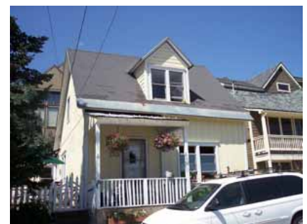
133 WOODSIDE AVENUE Significant Site Designated Feb. 4, 2009