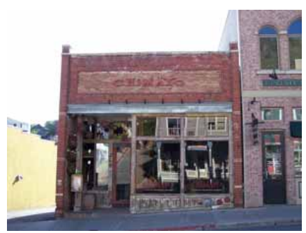
368 MAIN STREET Landmark Site Designated Feb. 4, 2009