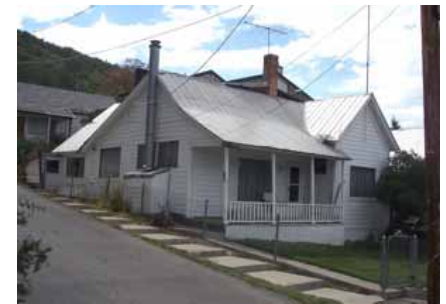
1003 NORFOLK AVENUE Landmark Site Designated Feb. 4, 2009