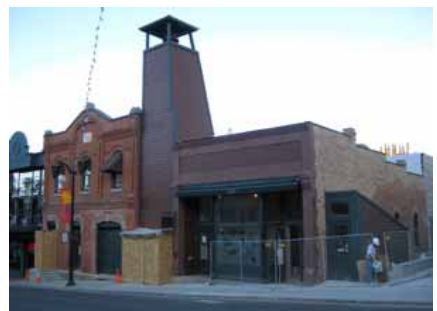
524-528 MAIN STREET Landmark Site Designated Feb. 4, 2009