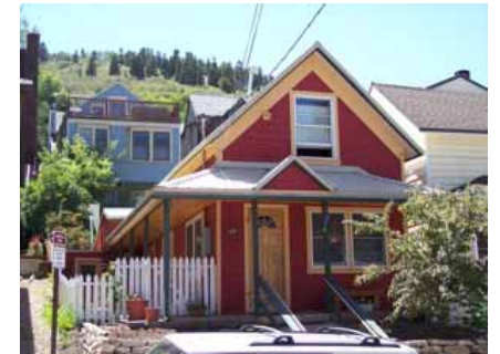
259 PARK AVENUE Landmark Site Designated Feb. 4, 2009