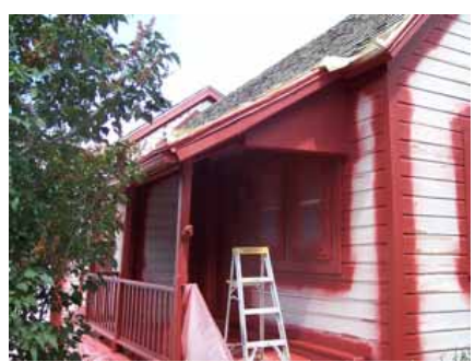
417 ONTARIO AVENUE Landmark Site Designated Feb. 4, 2009