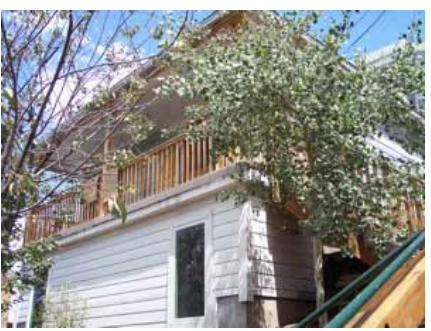
405 ONTARIO AVENUE Significant Site Designated Feb. 4, 2009