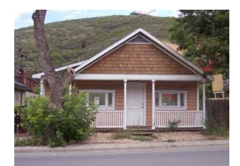
1326 PARK AVENUE (during construction) Significant Site Designated Feb. 4, 2009