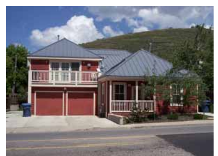
1488 PARK AVENUE Significant Site Designated Feb. 4, 2009