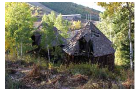
SILVER KING MINE WATER TANK D & E Significant Site Designated Feb. 4, 2009