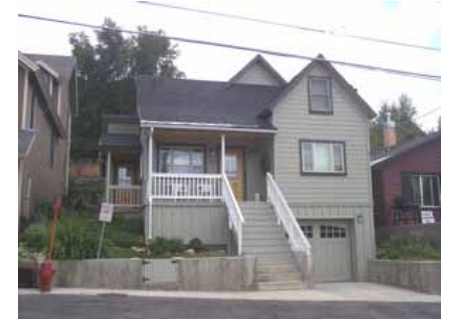
915 NORFOLK AVENUE Significant Site Designated Feb. 4, 2009