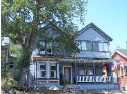
615 WOODSIDE AVENUE Significant Site Designated Feb. 4, 2009