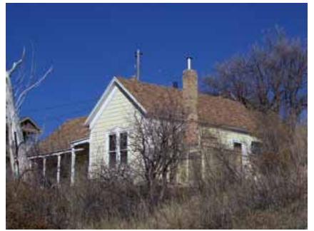
264 ONTARIO AVENUE Landmark Site Designated Feb. 4, 2009