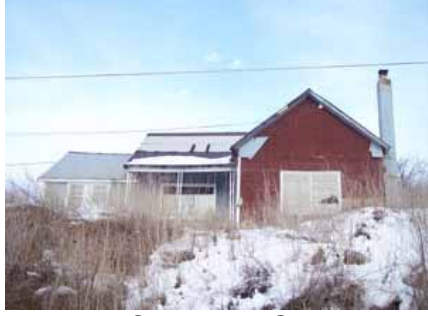
257 MCHENRY STREET Significant Site Designated Feb. 4, 2009