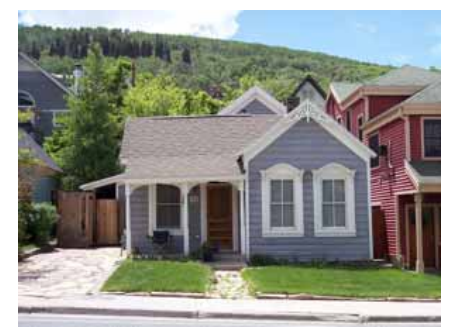
949 PARK AVENUE Significant Site Designated Feb. 4, 2009