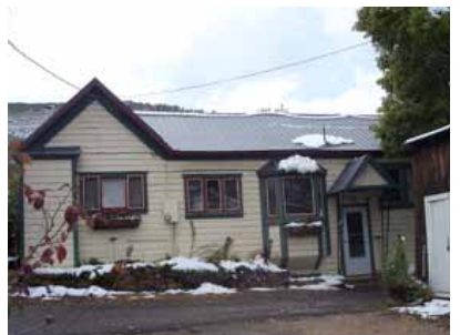
130 SANDRIDGE AVENUE Significant Site Designated Feb. 4, 2009