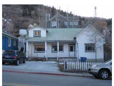
657 PARK AVENUE Significant Site Designated Feb. 4, 2009