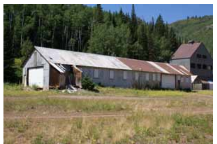
SILVER KING MINE STORES DEPT BLDG Significant Site Designated Feb. 4, 2009