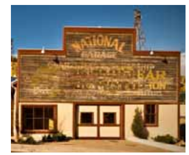
703 PARK AVENUE GARAGE (Pre-rehab) Landmark Site Designated Feb. 4, 2009