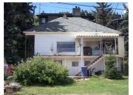
901 EMPIRE AVENUE Significant Site Designated Feb. 4, 2009