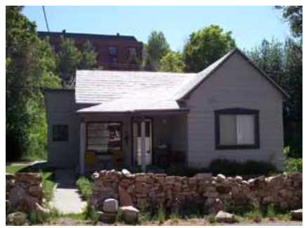
1455 WOODSIDE AVENUE Significant Site Designated Feb. 4, 2009