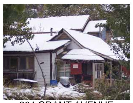
304 GRANT AVENUE Significant Site Designated Feb. 4, 2009