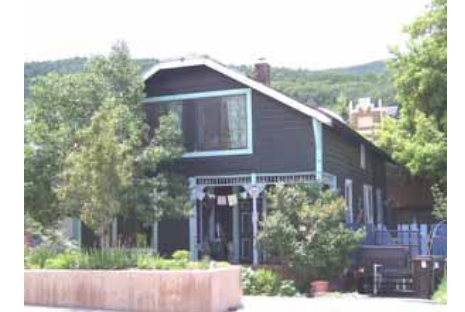
1209 PARK AVENUE Landmark Site Designated Feb. 4, 2009