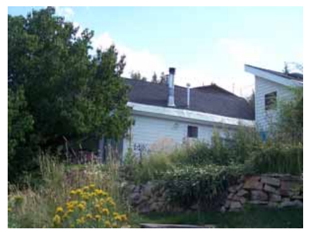
143 NORFOLK AVENUE Landmark Site Designated Feb. 4, 2009