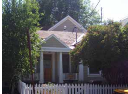
1103 WOODSIDE AVENUE Significant Site Designated Feb. 4, 2009