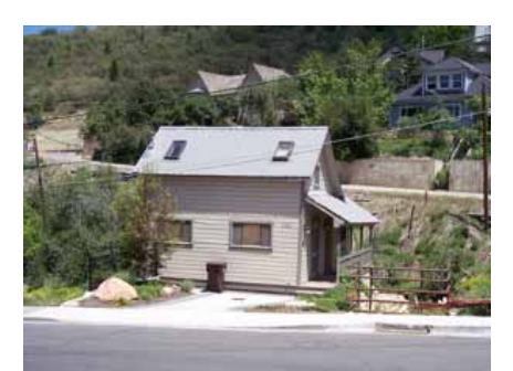
122 MAIN STREET Significant Site Designated Feb. 4, 2009