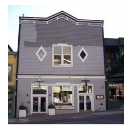
540 MAIN STREET Landmark Site Designated Feb. 4, 2009