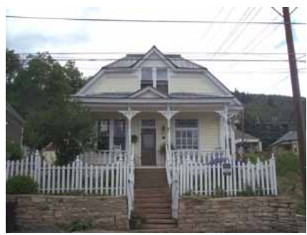
843 NORFOLK AVENUE Landmark Site Designated Feb. 4, 2009