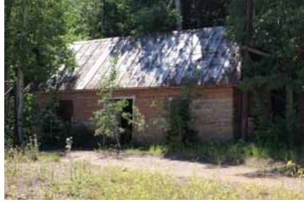
SILVER KING MINE TRANSFORMER HOUSE Significant Site Designated Feb. 4, 2009