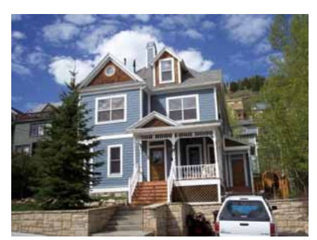
305 PARK AVENUE Significant Site Designated Feb. 4, 2009