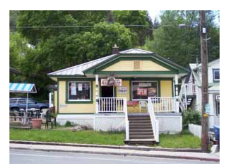
651 PARK AVENUE Landmark Site Designated Feb. 4, 2009