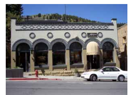
305 MAIN STREET Landmark Site Designated Feb. 4, 2009