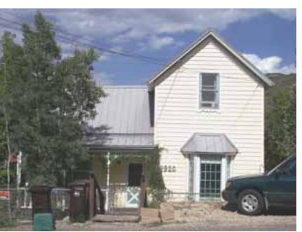
920 NORFOLK AVENUE Landmark Site Designated Feb. 4, 2009