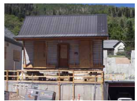
817 PARK AVENUE (Pre-rehabilitation) Significant Site Designated Feb. 4, 2009