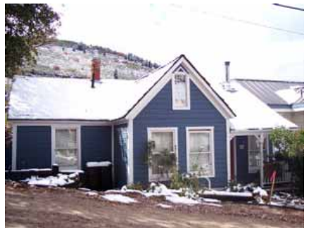
36 PROSPECT STREET Landmark Site Designated Feb. 4, 2009