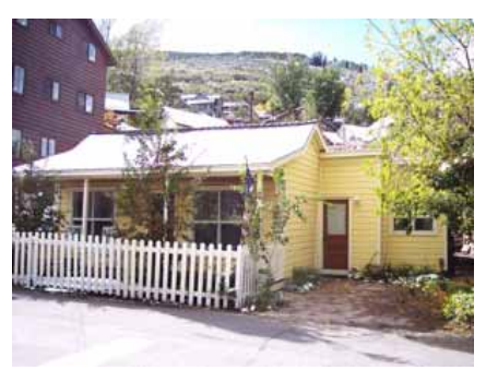
24 DALY AVENUE Significant Site Designated Feb. 4, 2009