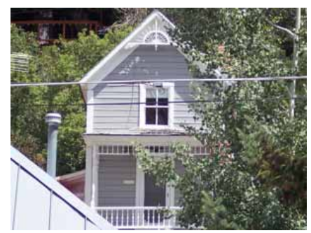
413 ONTARIO AVENUE Landmark Site Designated Feb. 4, 2009