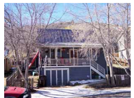
161 PARK AVENUE Landmark Site Designated Feb. 4, 2009