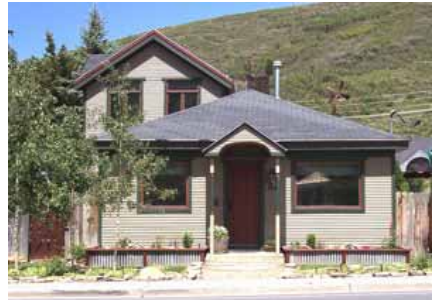
1328 PARK AVENUE Landmark Site Designated Feb. 4, 2009