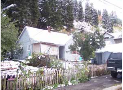
269 DALY AVENUE Landmark Site Designated Feb. 4, 2009