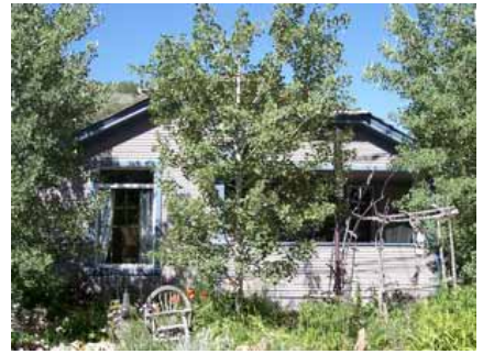
1100 WOODSIDE AVENUE Landmark Site Designated Feb. 4, 2009