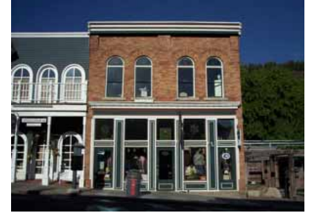
405 MAIN STREET Landmark Site Designated Feb. 4, 2009