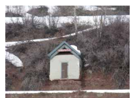
SILVER KING MINE BOARDING HSE VAULT Significant Site Designated Feb. 4, 2009