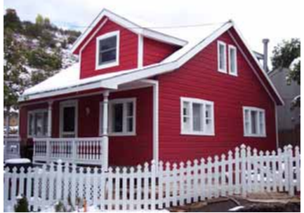
9 PROSPECT STREET Significant Site Designated Feb. 4, 2009