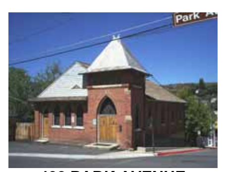
402 PARK AVENUE Landmark Site Designated Feb. 4, 2009