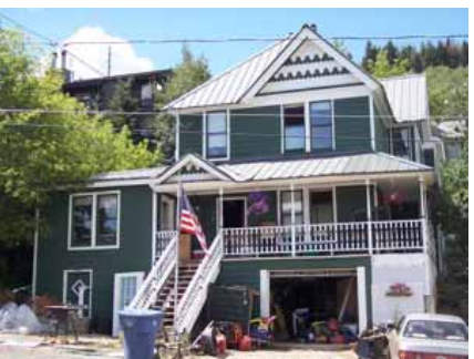
923 EMPIRE AVENUE Significant Site Designated Feb. 4, 2009