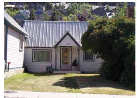
1129 PARK AVENUE Significant Site Designated Feb. 4, 2009