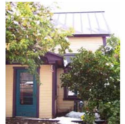
14 PROSPECT STREET Landmark Site Designated Feb. 4, 2009