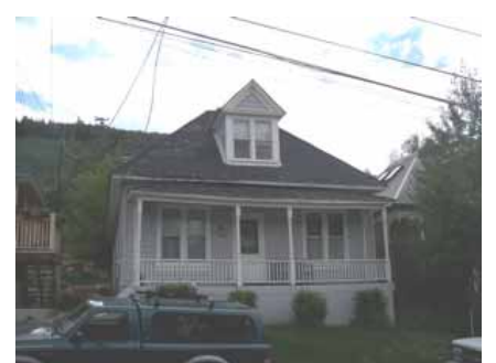
945 NORFOLK AVENUE Landmark Site Designated Feb. 4, 2009