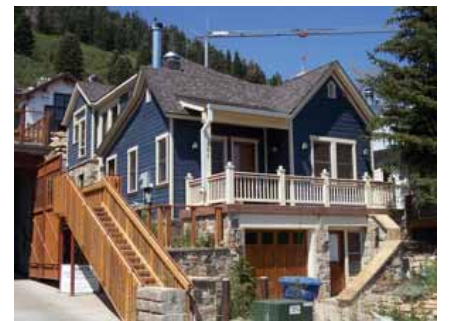
501 WOODSIDE AVENUE Significant Site Designated Feb. 4, 2009