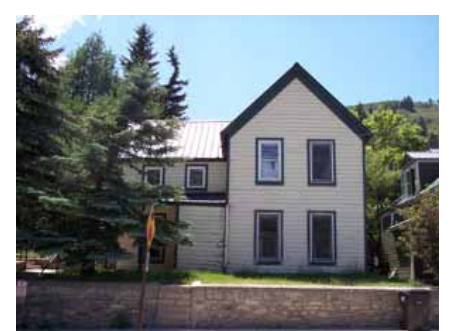
139 PARK AVENUE Landmark Site Designated Feb. 4, 2009