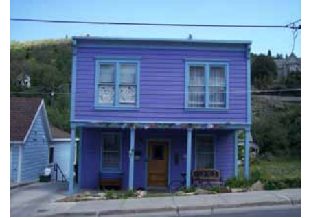
150 MAIN STREET Landmark Site Designated Feb. 4, 2009