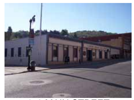
450 MAIN STREET Significant Site Designated Nov. 16, 2011