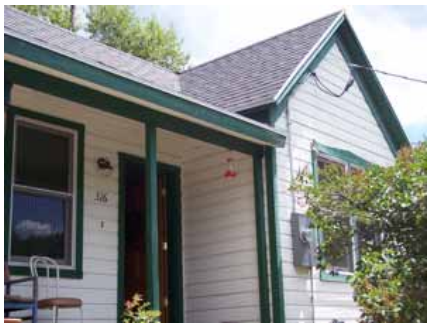
316 ONTARIO AVENUE Landmark Site Designated Feb. 4, 2009