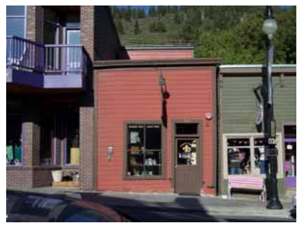
509 MAIN STREET Landmark Site Designated Feb. 4, 2009