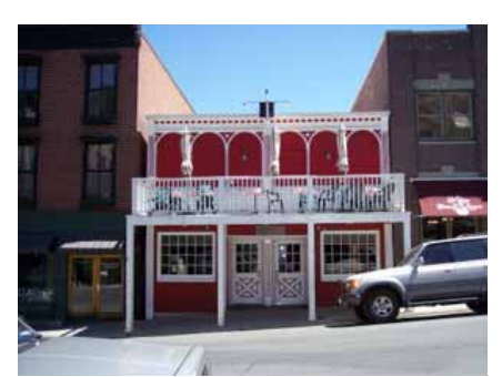
322 MAIN STREET Landmark Site Designated Feb. 4, 2009