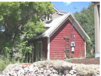
341 ONTARIO AVENUE Significant Site Designated Feb. 4, 2009