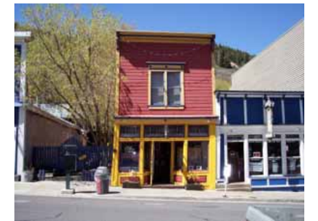
523 MAIN STREET Landmark Site Designated Feb. 4, 2009