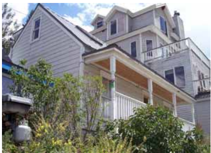
317 ONTARIO AVENUE Significant Site Designated Feb. 4, 2009