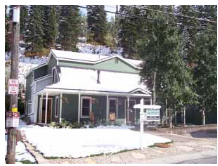
199 DALY AVENUE Significant Site Designated Feb. 4, 2009