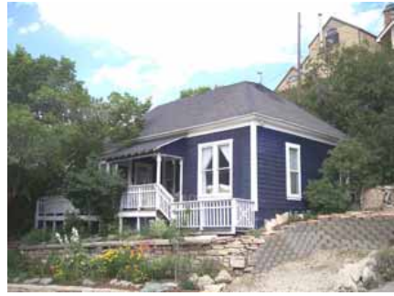
334 MARSAC AVENUE Landmark Site Designated Feb. 4, 2009