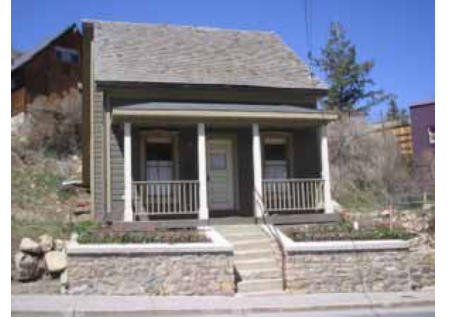
133 MAIN STREET Significant Site Designated Feb. 4, 2009