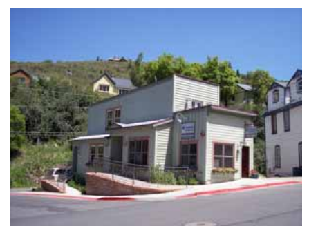
186 MAIN STREET Significant Site Designated Feb. 4, 2009