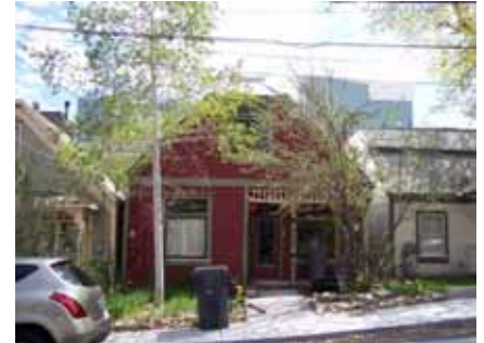
606 PARK AVENUE Landmark Site Designated Feb. 4, 2009