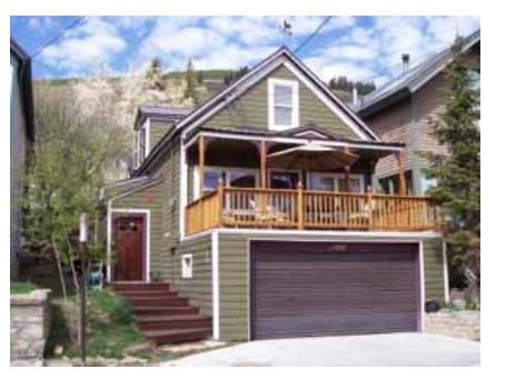
145 PARK AVENUE Significant Site Designated Feb. 4, 2009