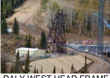
DALY WEST HEAD FRAME Significant Site Designated March 17, 2010