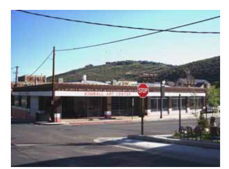
638 PARK AVENUE Landmark Site Designated Feb. 4, 2009