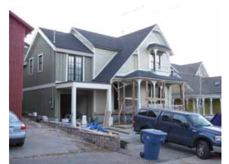
1045 WOODSIDE AVENUE Significant Site Designated Feb. 4, 2009