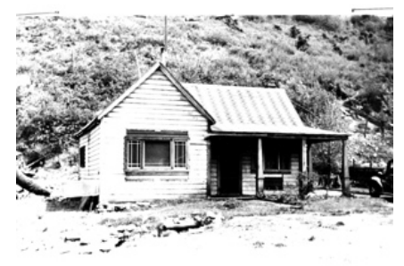
81 DALY AVENUE (tax photo - panelized) Significant Site Designated Feb. 4, 2009