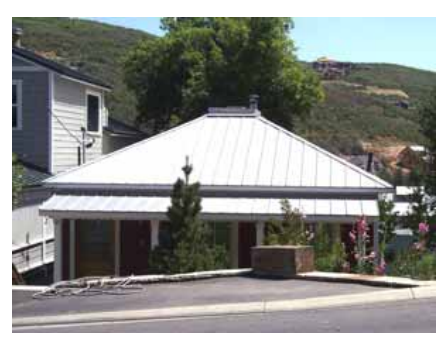
564 WOODSIDE AVENUE Landmark Site Designated Feb. 4, 2009