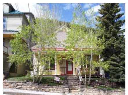
343 PARK AVENUE Landmark Site Designated Feb. 4, 2009