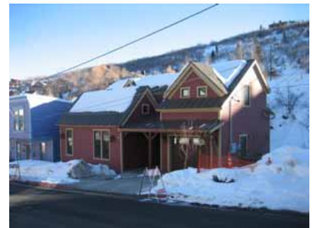
148 MAIN STREET Significant Site Designated Feb. 4, 2009