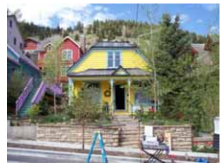
539 PARK AVENUE Landmark Site Designated Feb. 4, 2009